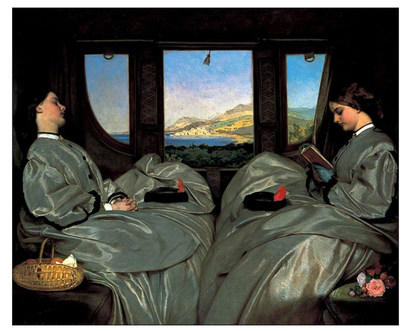
Fig. 2 : Augustus Leopold Egg, The Travelling Companions , 1862, oil on canvas. Birmingham Museums Trust.