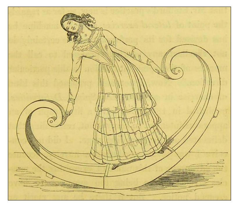
Fig. 3: Edward W. Duffin, On Deformities of the Spine (London: Churchill, 1848), p. 125.