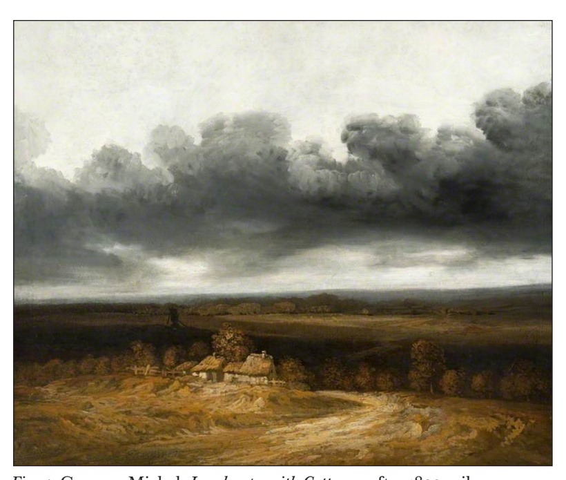
Fig. 4: Georges Michel, Landscape with Cottages, after 1830, oil on canvas, 78.5 \times 99.2 cm, Kelvingrove Art Gallery and Museum. Art UK. Photo credit: Glasgow Museums.

Although Van Gogh's word painting here is a brilliant evocation of Michel's work such as The Storm (1830) or Landscape with Cottages (after 1830) ( Fig. 4 ), the yellow sandy road across moorland, past whitewashed huts have very little to do with Eliot's description of lush Loamshire in Adam Bede . In terms of composition, too, it is worth noting that in Michel's works the human figures are tiny marks on the road; the road itself a ribbon across a landscape seen from a high remove as if the artist were soaring somewhere