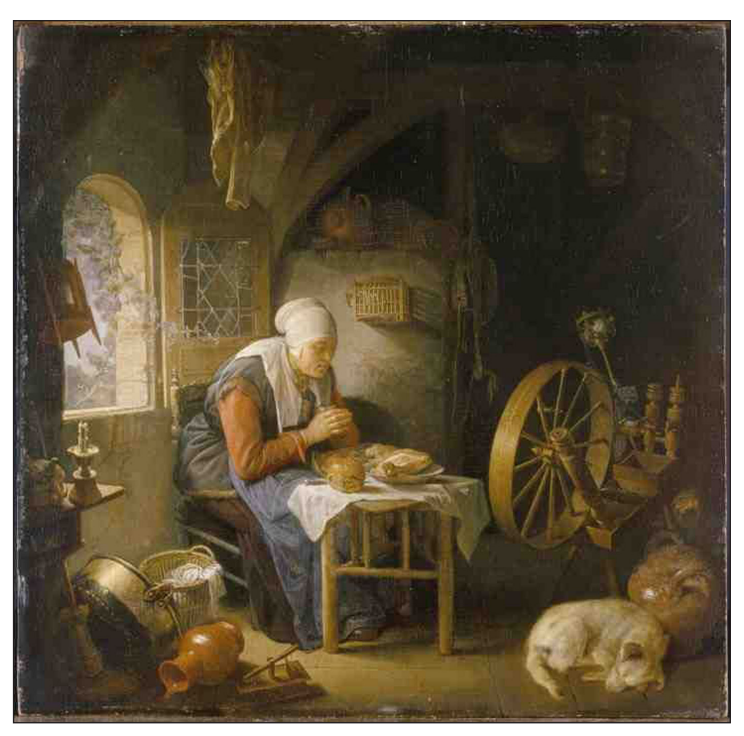
Fig. 2: Gerard Dou, The Spinner's Prayer , c. 1645, oak, 27.5 × 28.5 cm, Bayerische Staatsgemäldesammlungen — Alte Pinakothek Munich. CC-BY-SA 4.0.