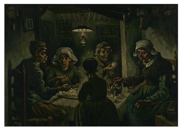
Fig. 3: Vincent Van Gogh, The Potato Eaters , 1885, oil on canvas, 82 × 114 cm.