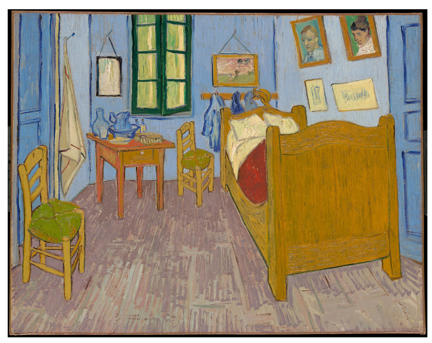
Fig. 1: Vincent Van Gogh, Bedroom in Arles, 1889, oil on canvas, 57.3 × 74 cm, Musée d'Orsay, Paris.

family in 1876 to his return to it as a shared code with his sister in 1889 — suggest a life lived on the path mapped out by the hero of Eliot's novel.