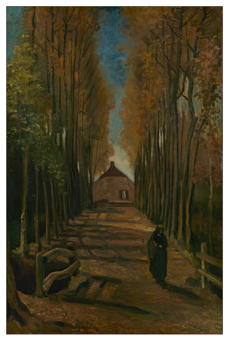
Fig. 5: Vincent Van Gogh, Avenue of Poplars in Autumn, 1884, oil on canvas on panel, 99 × 65.7 cm.

jumping to her death — are made in and of themselves luminous as they become the objects that produce hope and despair. The seemingly humdrum here is the matter of life or death. Adam Bede is, as its epigraph on the title page from Wordsworth's The Excursion (1814) emphasizes, a novel concerned with 'nature's unambitious underwood | And flowers that prosper in the shade'. But Eliot's debt to Spinoza is evident in the novel's interest in the immanent significance of the matter of all life encountered in the