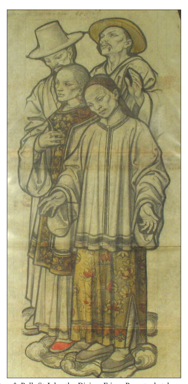
Fig. 4: Clayton & Bell, St John the Divine, Friern Barnet, sketch, 1902?, installed 1906. Part of a set of eleven two-light windows in the apse and east end depicting the Adoration of the Lamb. The figures, who are recognizably Chinese, stand on clouds and look towards the Lamb. Given the date and the theme of the window it is likely that they represent Christian martyrs killed in the recent Boxer Rebellion.