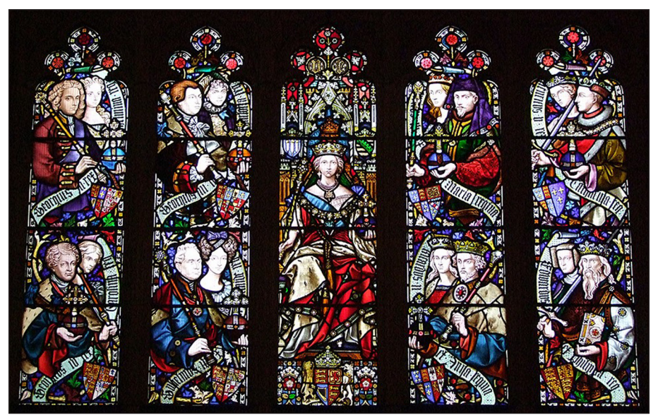
Fig. 8: Clayton & Bell, Royal window, Great Hall, University of Sydney, c. 1859.