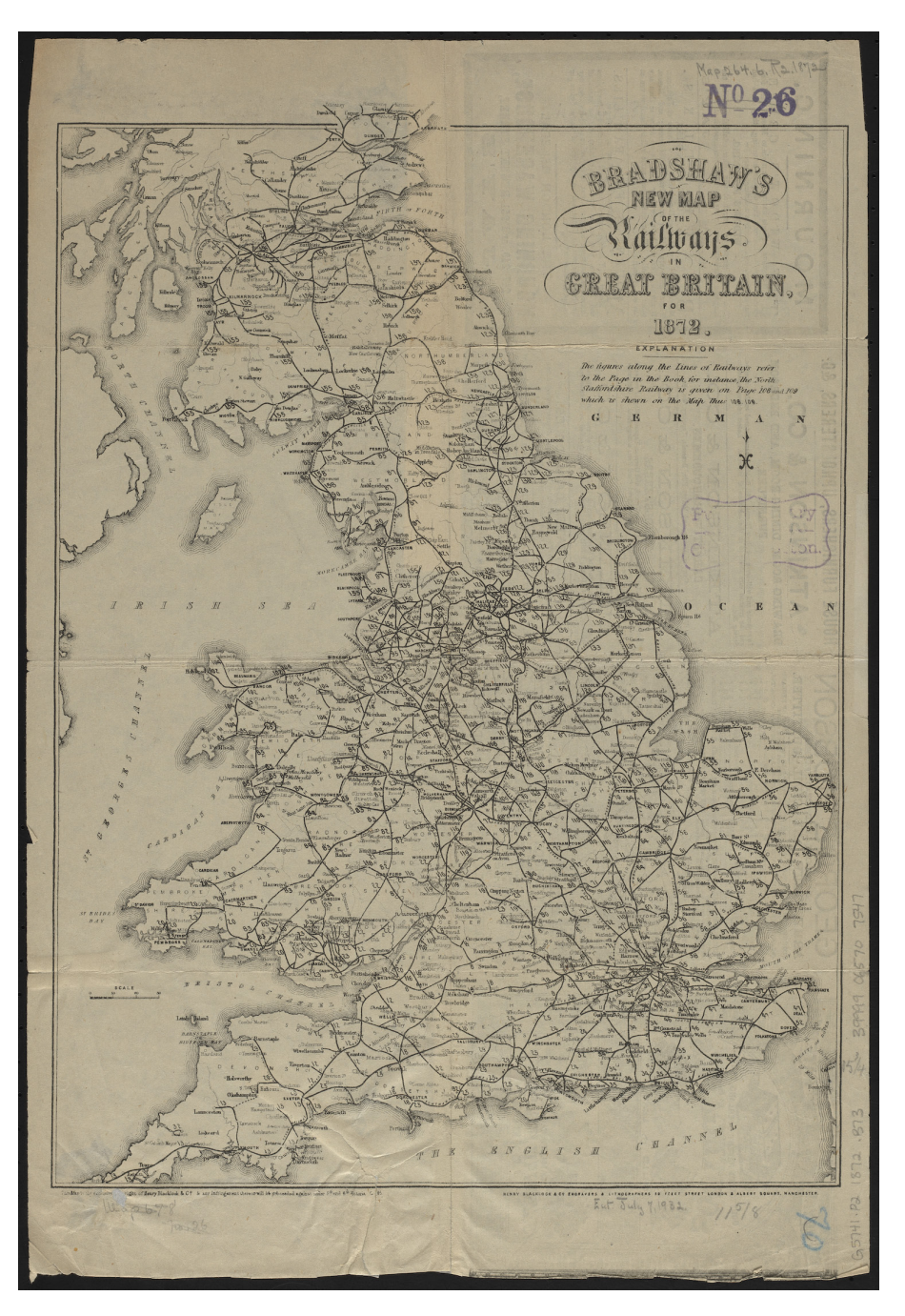
Fig. 1: 'Bradshaw's New Map of the Railways in Great Britain' (Manchester: Blacklock, 1872).

intersecting trunk and branch lines facilitated national mobility with varying degrees of ease. As an extensive national network of public transportation, the railway could both contain and represent the nation. It was this imagined open accessibility and influence throughout almost all areas of national operation that prompted concern. Britain's internal transportation, communication, and industries had become reliant on a well-connected, functioning rail network.