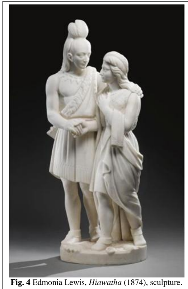
Fig. 4 Edmonia Lewis, Hiawatha (1874), sculpture.

But Lewis also adapted classical traditions in sculptures that directly referenced her dual ethnicity. Her depictions of Hiawatha and Minnehaha were doubtless influenced by the popularity of Longfellow’s poem (see fig. 4 ). She was certainly not the first American to employ Indian themes in ideal sculpture, but she