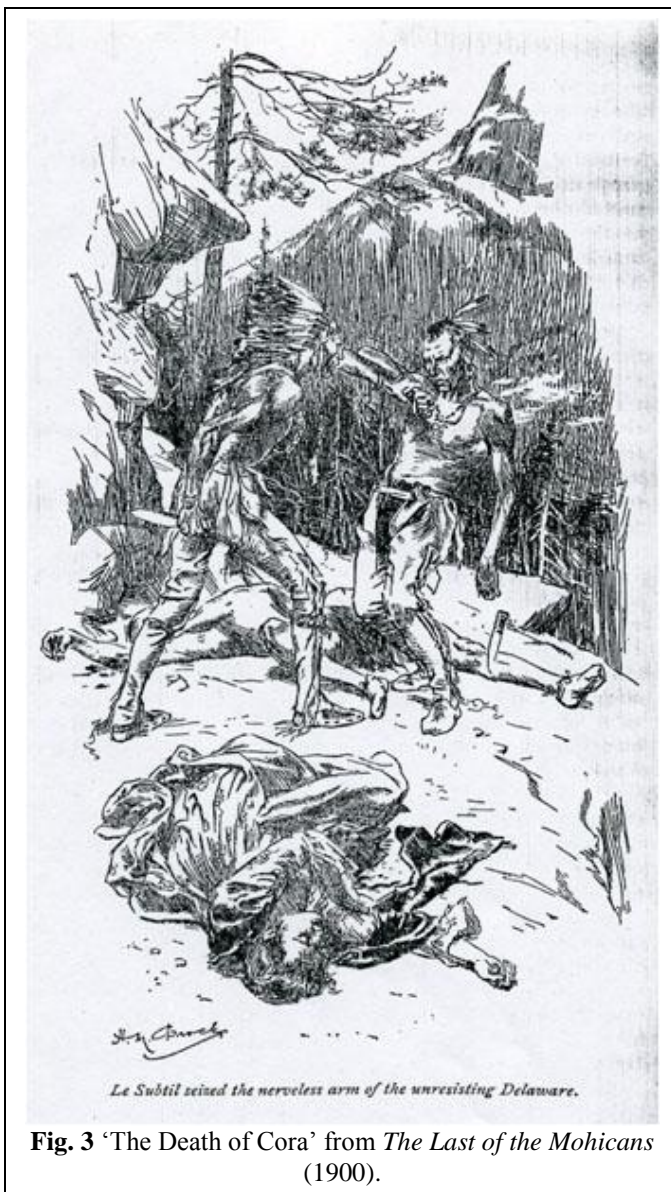
Fig. 3 'The Death of Cora' from The Last of the Mohicans (1900).

The point that I am making here develops and complicates Barringer's sense of the transatlantic. The artists, again, are British interpreting America; yet in this case, they are subject to the influence of American illustrative art, rather than making American topics fit British-generated conventions. This is the place to note, too, the importance of several widely circulating American journals within Britain (especially Harper's Magazine ) when it came to creating a visual sense (whether realistic or