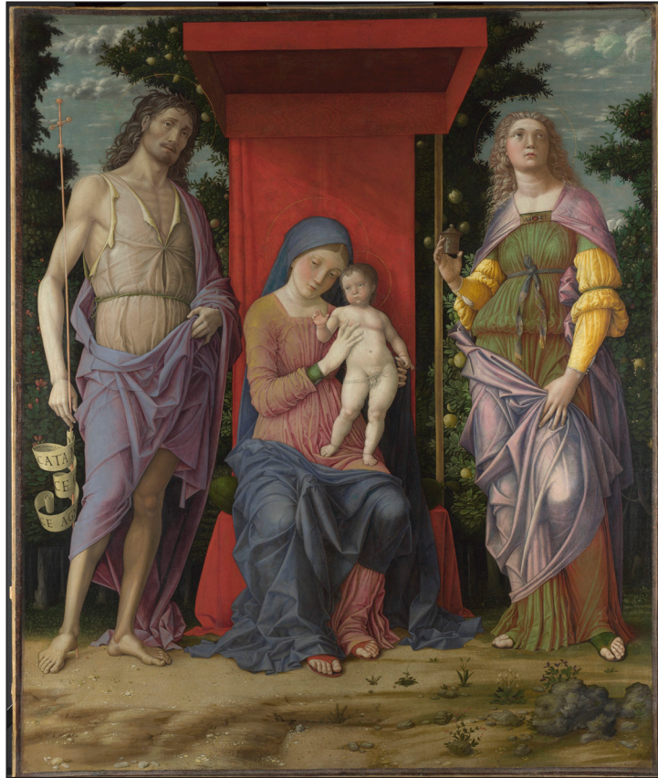
Fig. 1: Andrea Mantegna, The Virgin and Child with Saints , probably 1490–1505, tempera on canvas, 139.1 × 116.8 cm, National Gallery, London (NG274).

Italian schools as his primary objective for purchase, reasoning that they represented most succinctly the trajectory of art's development and noting that the collection severely lacked examples of earlier paintings. 38 The Mantegna was among this new cohort of works to enter the collection, its arrival reported in the Illustrated London News with a full-page engraving (Fig. 2).