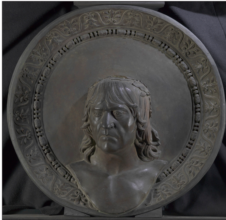
Fig. 3: Anon., Bust Portrait of Andrea Mantegna , c. 1880, plaster of Paris with a 'bronzed' finish on plaster, 75 cm, National Gallery, London (NG2250).

Together with works in public collections and in situ , Cartwright frequently drew attention in her publications to prominent old master