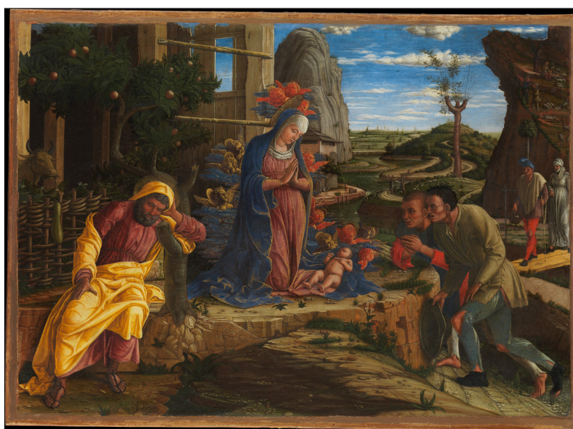
Fig. 4: Andrea Mantegna, Adoration of the Shepherds , shortly after 1450, tempera on canvas, transferred from wood, 40 × 55.6 cm, Metropolitan Museum of Art, New York (32.130.2).

artworks housed in British private collections. In 1882 Mantegna's Adoration of the Shepherds (after 1450), then in the Boughton-Knight collection at Downton Castle, Herefordshire, was publicly displayed for the first time at the Burlington House Winter Exhibition of Old Masters (Fig. 4). 58 The work's provenance, traceable directly to the Gonzaga, and excellent state of preservation drew much attention and Cartwright did not hesitate to be the first to feature it, included in a thematic article on 'The Nativity in Art' published the following year in the Magazine of Art . 59 She also took the opportunity of requesting that the work be engraved for the first time, acknowledging the permission obtained from Charles Boughton-Knight to do so for her article. Alongside the full-page reproduction, Cartwright described the work 'as fresh and brilliant as a Limoges enamel' and 'a tiny