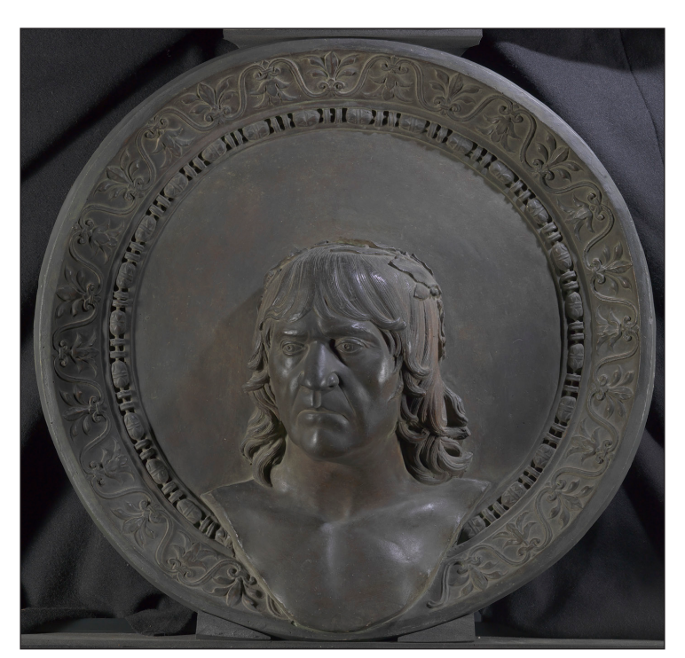
Fig. 3: Anon., Bust Portrait of Andrea Mantegna, c. 1880, plaster of Paris with a 'bronzed' finish on plaster, 75 cm, National Gallery, London (NG2250).

Together with works in public collections and in situ, Cartwright frequently drew attention in her publications to prominent old master