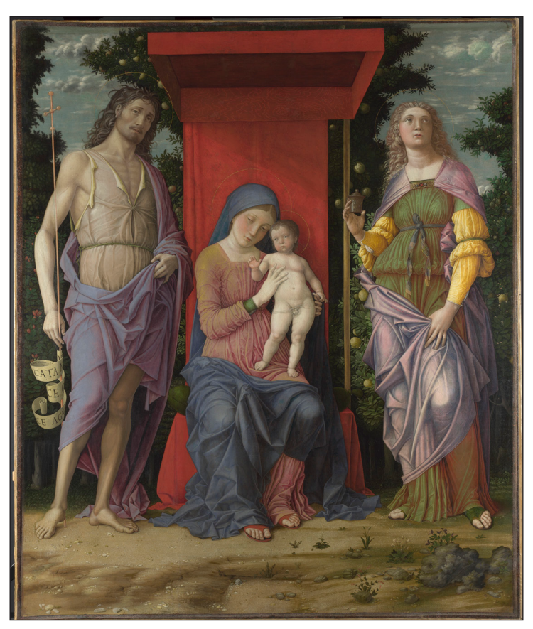
Fig. 1: Andrea Mantegna, The Virgin and Child with Saints, probably 1490–1505, tempera on canvas, 139.1 \times 116.8 cm, National Gallery, London (NG274).

Italian schools as his primary objective for purchase, reasoning that they represented most succinctly the trajectory of art's development and noting that the collection severely lacked examples of earlier paintings.<sup>38</sup> The Mantegna was among this new cohort of works to enter the collection, its arrival reported in the Illustrated London News with a full-page engraving ( Fig. 2).