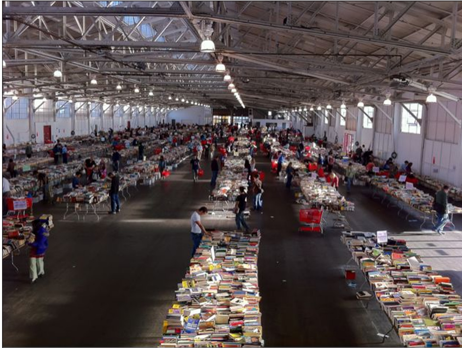
Fig. 6: 200,000 books donated by the Friends of the San Francisco Public Library (2011).

perverse effect of crippling access. We need new systems but, in the meantime, the best way to be read is to not charge each reader for access.