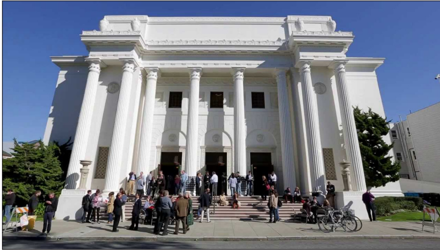
Fig. 1: A former Christian Science church, the Internet Archive 's headquarters is located at 300 Funston Avenue, San Francisco.

Though the Internet Archive is more than a nineteenth-century research library, it is one of the largest repositories of digitized nineteenth-century materials in the world. It is difficult to imagine doing research in nineteenth-century studies without using the Internet Archive . Freely available, the Archive 's holdings, its multiple digitized copies of single books, its interface with its word search, uploading and downloading functions, sound application, and beta-feedback are invaluable to nineteenth-century scholars worldwide. And the impact of the Internet Archive on teaching is just as important, both inside and outside the classroom.