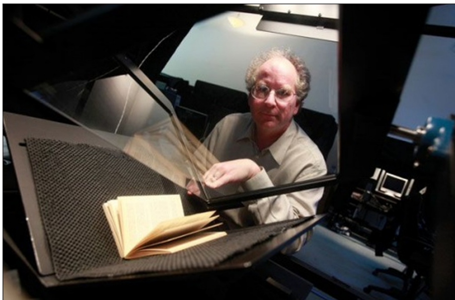
Fig. 2: Brewster Kahle.

As a regular user of the Internet Archive , it seems to me that in addition to preserving digital history, the Archive's mission is also to translate and preserve our hard culture into digital format. Is that the case and, if so, is it working? Are there pitfalls?