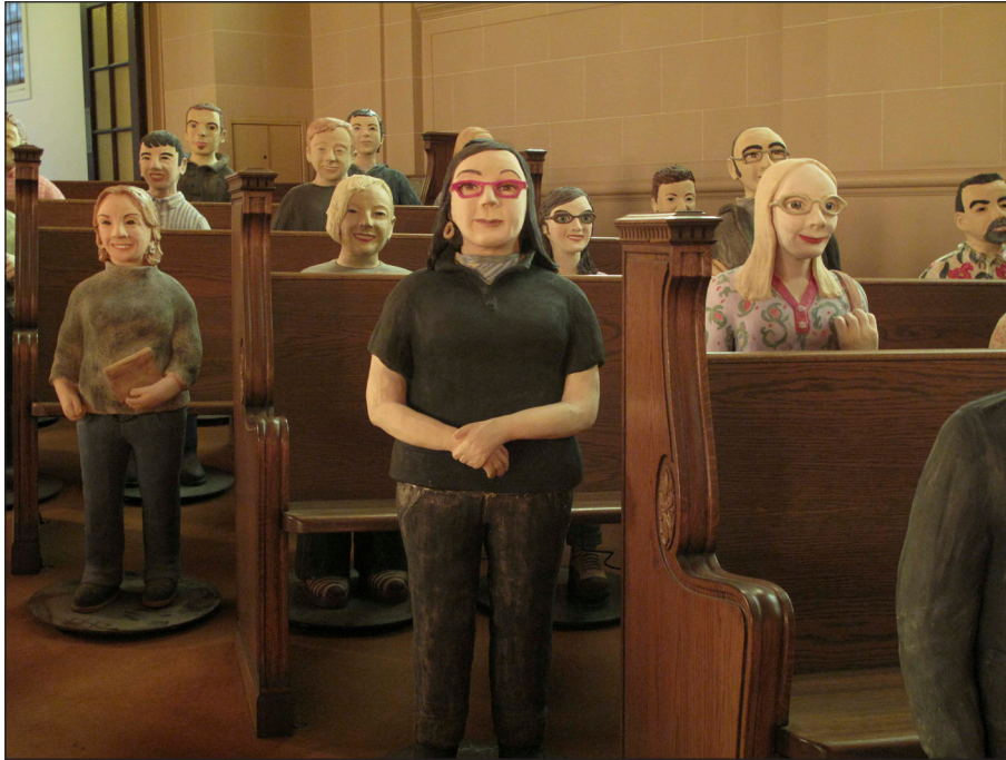
Fig. 5: Terracotta archivists at the Internet Archive. This artwork is based on the terracotta army of Qin Shi Huang and is the Internet Archive way of thanking those archivists who have served at the organization for at least three years.

Currently, we are funding limited. But given the funding (ten cents a page), I believe we can get access to the collections in the great libraries. But then we must also preserve the physical versions. Fortunately that is getting cheaper as well — if most of the access is to the digital versions, then the physical versions can be stored more densely and safely. We do not need to be deaccessioning as much as we have been because it is less expensive to save materials. The Internet Archive now has two large physical archives where we are storing over one million books, and tens of thousands of films, records, and microfilm reels. This can and should be done by everyone. But if others cannot store them, we hope they will think of us ( Fig. 6 ).