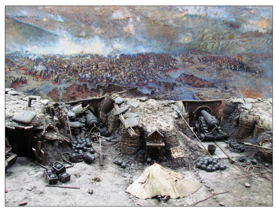
Fig. 8: Franz Roubard, Panorama of the Heroic Defence of Sebastopol, 1905. A. L. Berridge.

To stand inside the Panorama is to understand why the Crimean War holds such a special place in Russia's national consciousness. Russian performance was as patchy as Britain's, marred by the same problems of poor commanders, dreadful communication, and inadequate supplies, but at the heart of it lies the astonishing heroism of this gallant defence. At 349 days it lasted longer even than the second siege of 1941–42 and is considered to bear its own credit for Sebastopol's official designation as a 'Hero City'.