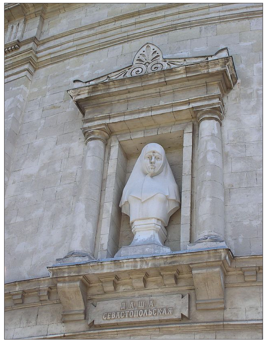
Fig. 3 : Bust of Dasha Sevastapolskaya on the Panorama Museum, Sebastopol.

Dasha, however, was serving on her own ground, and the involvement of British civilians is far more significant. Few could emulate Seacole and go to Crimea themselves, but the scale of the public response to Russell's reports was unprecedented, and marks the beginning of a shift in consciousness which would change forever the way in which the British