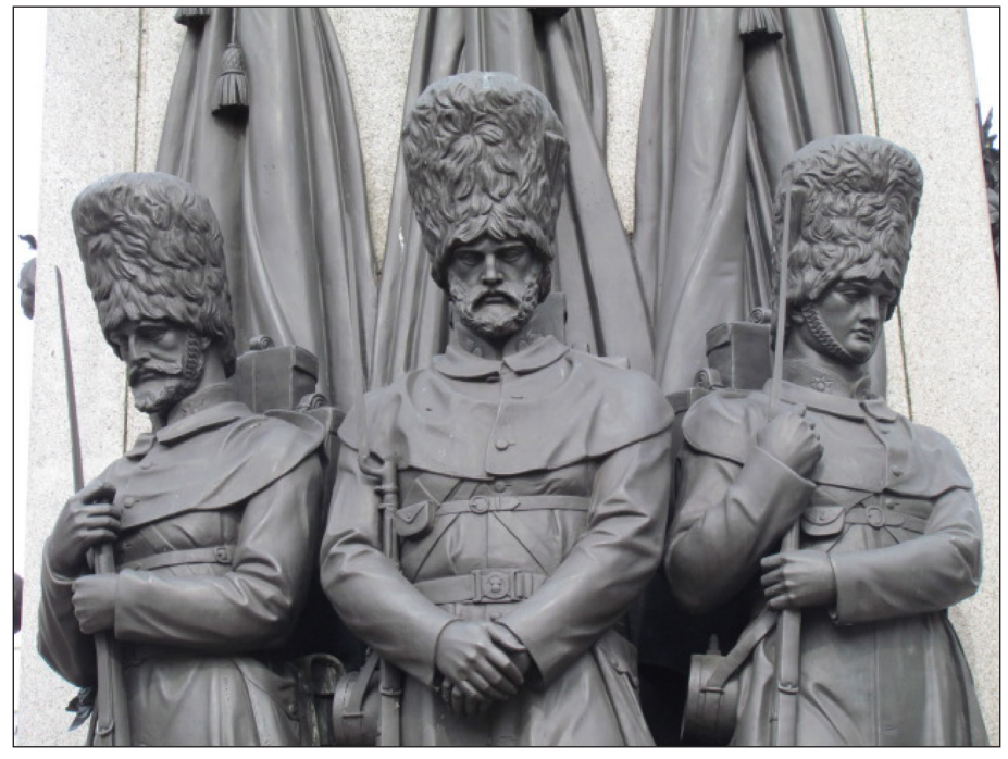
Fig. 5: John Bell, Detail from Crimean War Memorial, Waterloo Place, London, 1861. A. L. Berridge.

But it still simmers in the public mind, and we can see its legacy clearly in the changing face of Britain's war memorials. Major commemorations before the 1850s tend to be either grand architectural features or statues of the commanders in suitably warlike poses, but the focus of the Crimean War Memorial in Waterloo Place is the men themselves. The reason may simply be that John Bell's work was originally tended specifically as a memorial to the Guards, but the presentation is strikingly different from any that preceded it, and has set the pattern for all that would follow ( Fig. 5 ). There is nothing jubilant about these figures. They are grim, even sombre, and the eyes of the outer pair are actually downcast. The sculpture honours sacrifice rather than victory, and these figures make clear exactly whose it was.