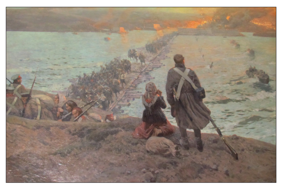
Fig. 6 : Franz Roubard, Last Look, 1901–02. Museum of the Black Sea Fleet History, Sebastopol.

Even that withdrawal has a heroic drama to it. In the course of a single night, the entire population of the town was secretly and silently evacuated over a hastily constructed floating bridge while their homes were set ablaze behind them. It is a great human story, and as I stood in front of Roubaud's moving Last Look in Sebastopol I could not help a pang of novelist's regret that I was writing from the point of view of the British rather than the Russians ( Fig. 6).