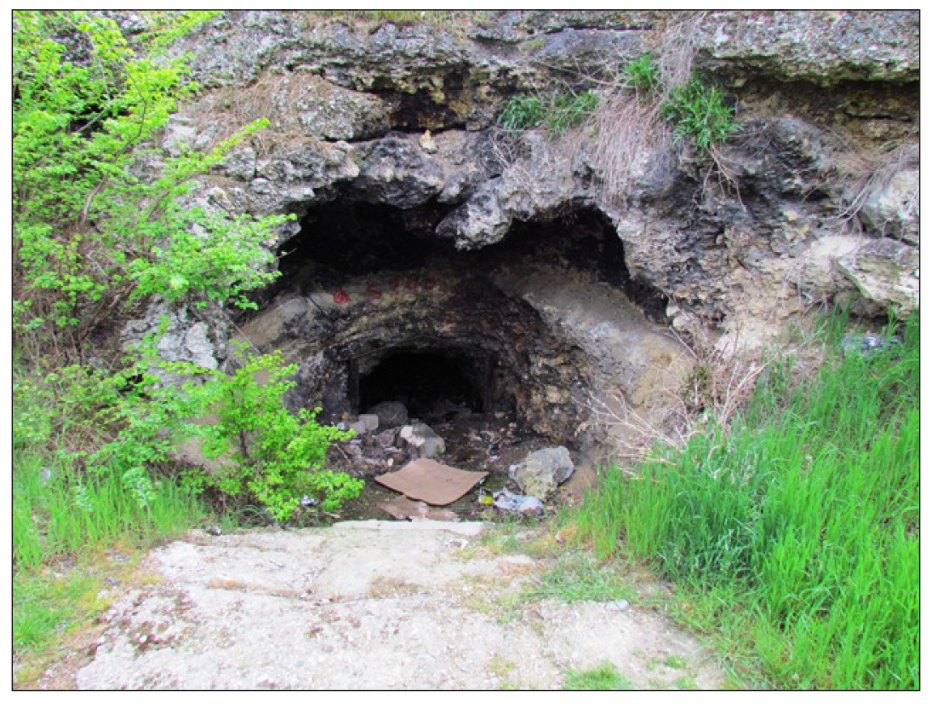
Fig. 7 : Opening to countermine preserved at Number 4 Bastion, Sebastopol. A. L. Berridge.

For if the 'Siege of Sebastopol' struggles to find popular appeal, the 'Defence of Sebastopol' does not. Crimea itself bristles with memorials and museums to the nineteenth-century conflict, and while the supposed victors of the war have quietly forgotten it, the losers celebrate it to this day. Much of Sebastopol was destroyed in the Second World War but the site of every bastion has been marked and memorialized, and even the harbour contains a monument to the sunken ships that saved the town from the Allied Fleet in 1854. The central feature is Number 4 Bastion (the Flagstaff) where the gabion defences have been painstakingly recreated and openings to the original Russian countermines have been preserved. One is given special prominence, and purports to be the very sap in which Todleben crouched on 30 January 1855 to listen to the digging of the approaching French ( Fig. 7 ).