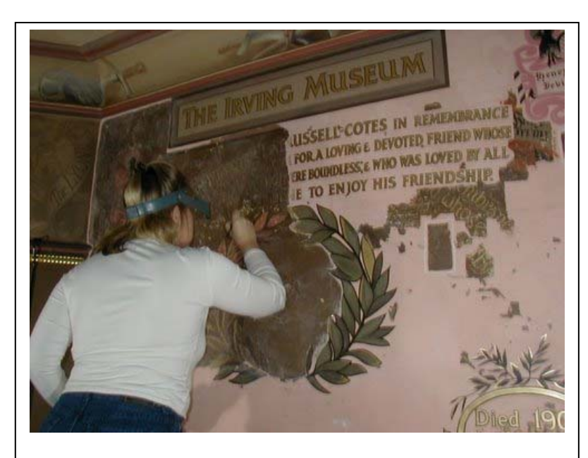
Fig. 4 Conservator working on Irving Room mural decoration (P1010093 Russell-Cotes Art Gallery and Museum).

conferred, as on other enterprises, by an endless succession of pompous speeches after-dinner (like those given Macready's retirement supper 1851 and printed at length in Tallis's edition of Shakespeare later that year), and we are delighted to be able to include in this issue of 19