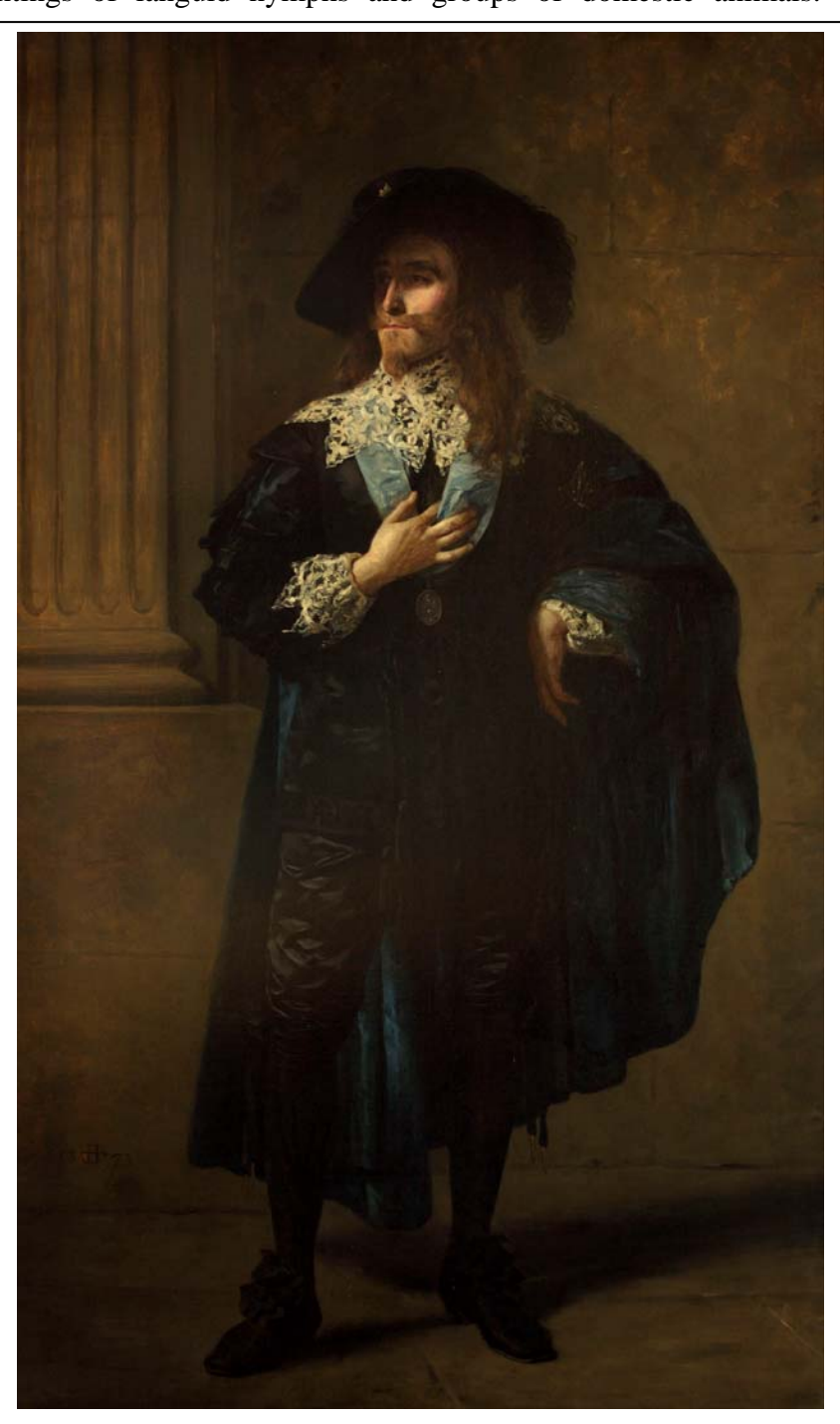
Fig. 2 James Archer, Henry Irving as Charles I , oil on canvas, 1873 (BORGM 00160 Russell-Cotes Art Gallery and Museum).

Russell-Cotes' muchname-dropped guests at his Royal Bath Hotel included door next Oscar Wilde, who was impressed by the works of art which would later be moved to the house ('You have built and fitted up with the greatest beauty and elegance, a palace,' Russell-Cotes remembered him saying, 'and fitted it with gems of art, for the use and benefit of the public at hotel prices'), but unfortunately Wilde had been disgraced by the time East Cliff Hall was built.<sup>2</sup> The prime famous guest Russell-Cotes craved was someone altogether less controversial, namely Henry Irving, given the first theatrical ever