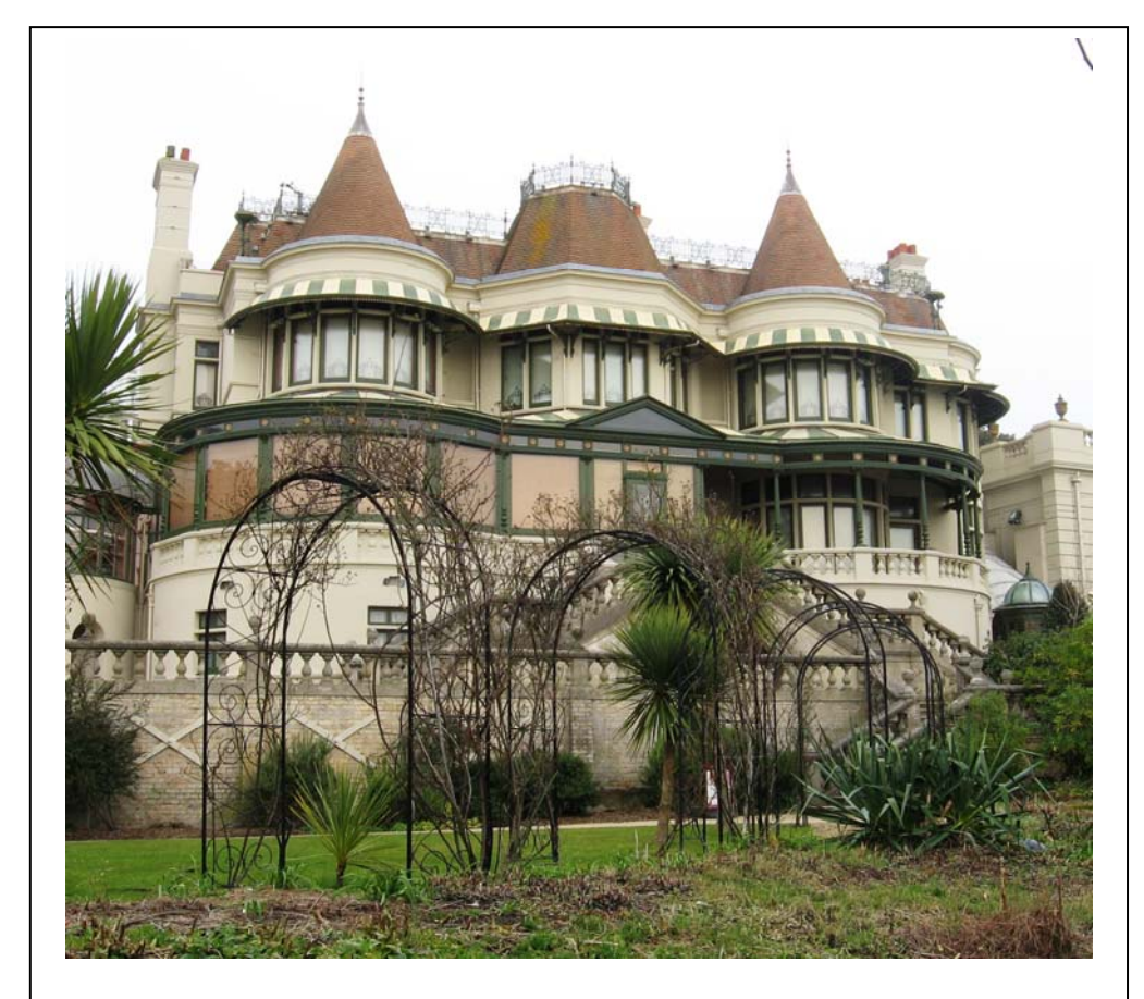
Fig. 1 Exterior of the Russell-Cotes Art Gallery and Museum, Bournemouth.

accumulated trophies and bibelots cluttering its rooms or the acres of tastefully-exposed nipples adorning its walls. The gallery is now expertly curated, and was lovingly refurbished with the help of lottery money in the 1990s, but when I was young it was a faded and Gothic place, simply the grandest of all the many Victorian houses in the town where someone had died and nobody had known what to do with all their obsolete possessions. If it hadn't been for the portraits of a florid and proprietorial Russell-Cotes hung in key positions, and the sheer force of body and will commemorated by the suits of Samurai armour and African masks filling the upstairs bedrooms, East Cliff Hall might have been Miss Havisham's holiday house.