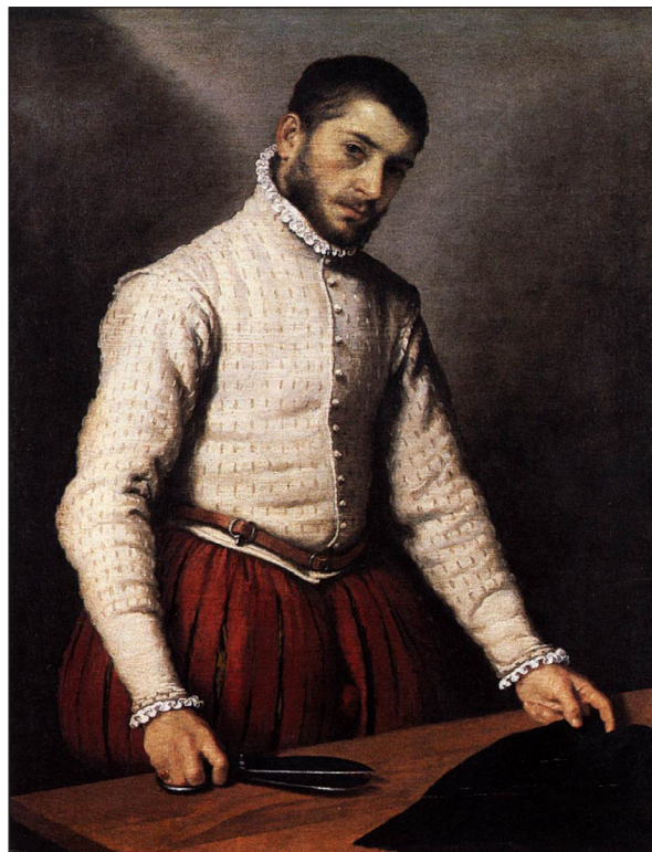
Fig. 1: Giovanni Battista Moroni, The Tailor , c. 1570, oil on canvas, 99.5 × 77 cm, National Gallery, London. CC BY-NC-ND 4.0 .

Portrait of a tailor in a white doublet with minute slashes — dark reddish nether dress — a leather belt [strap & buckle] round the end of the white dress. He stands before a table with scissors in his rt hand, & a piece of [black] cloth in the left.