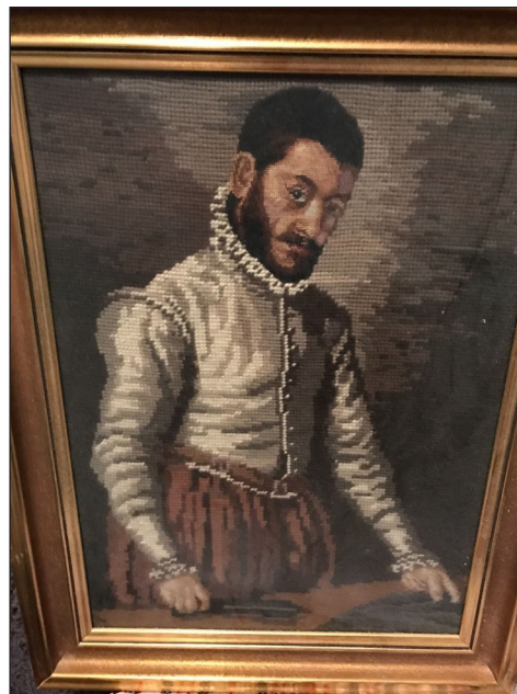
Fig. 6: Anon., Needlepoint copy of Moroni's Tailor , 20th century, 40.6 × 29.2 cm, private collection. Reproduced by kind permission of the artist and owner.