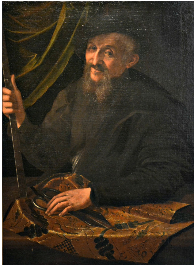
Fig. 3: Girolamo Mazzola Bedoli, Portrait of a Tailor , c. 1545, oil on canvas, 88 × 71 cm, Museo di Capodimonte, Naples.

tailor really was an artisan, yet already in 1545 Pietro Aretino complained that portraiture was currently being degraded by depicting craftsmen like tailors, perhaps in allusion to Girolamo Mazzola Bedoli's painting of the very same year ( Fig. 3 ). 8 In comparison with Moroni's, Bedoli's tailor is old, clad in black, shown with the tools of his trade and a luxurious piece of fabric which achieve foreground status. Seated behind a table, with only the upper part of his body visible, the tailor's head and hands are lit, to emphasize the interplay between mental creativity and manual labour which characterizes the profession. By contrast, Moroni's tailor is young, erect, sexualized by the codpiece which emerges from his slashed breeches and by his confrontational gaze. Clad in the red and white often