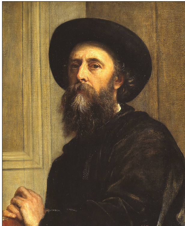
Fig. 4: George Frederic Watts, Self-Portrait , 1864, oil on canvas, 64.8 × 52.1 cm, © Tate Britain, London. CC-BY-NC-ND 3.0 (Unported) < https://www.tate.org.uk/art/artworks/watts-self-portrait-no1561 >.

Three exclamation marks and three imperatives in a row at the very end of the essay — could Moroni's Tailor ask for a better welcome into the London world of art? Lodged safely in one of the most rapidly expanding national institutions, the painting was turning into an institution in its own right, a treasure of the past with the imperative to influence the portraiture of the future. In singling out the Italianate G. F. Watts as the modern inheritor of Moroni's style, the reviewer predicted the whole series of Victorian sages soon to be caught by Watts's paintbrush and admitted to the National Portrait Gallery. Watts's own self-portrait of 1864 ( Fig. 4 ) testifies all too