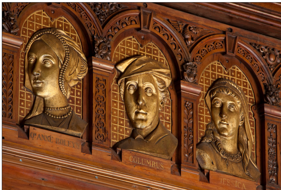
Fig. 2: Nathaniel Hitch, Relief portraits for Lord Astor at Two Temple Place, c. 1894-96. Two Temple Place, London.