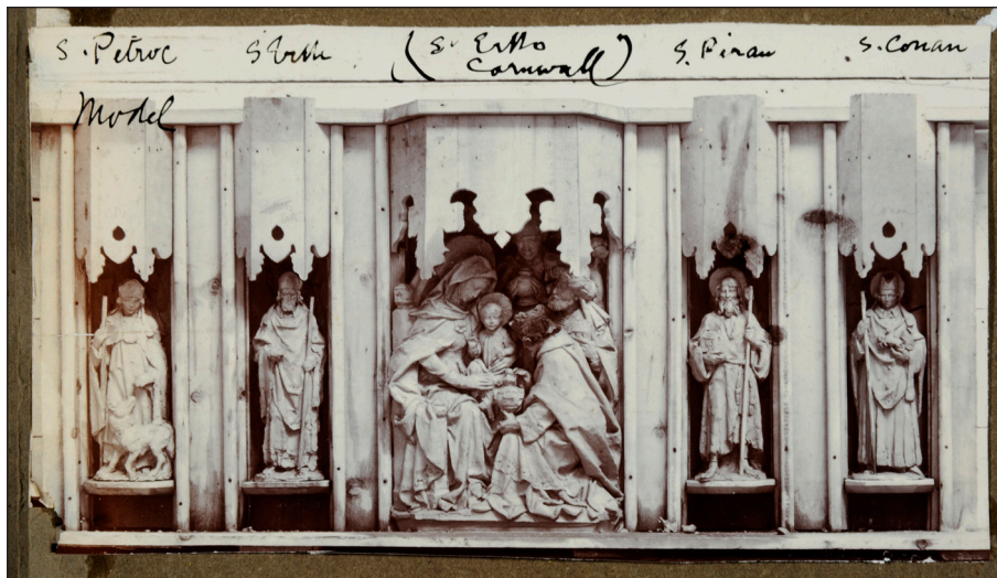
Fig. 6: Nathaniel Hitch, Photograph of a clay and wood model for a reredos for St Erth's parish church in Cornwall. 1999.1 Photograph album of the sculpture of Nathaniel Hitch and others, c. 1890–1930, Henry Moore Institute.

plaster cast. Damp cloths would have kept the clay sufficiently moist during works, particularly if they were operating in adjacent workshops. The relationship between the clay model and the final work can be seen in the following two photographs (Figs. 6, 7). The first documents Hitch's clay model for a reredos for St Erth's parish church in Cornwall; the second, the