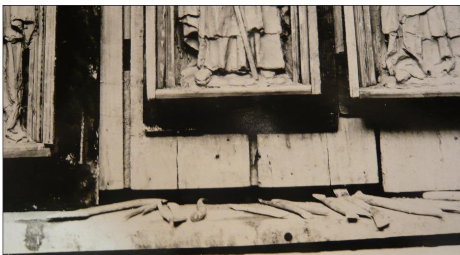
Fig. 5: Nathaniel Hitch, Photograph of a clay and wood model for the reredos for the church of St Mary & St Michael's in Egremont, Cumbria (detail). Note the modelling tools on the shelf. 1999.1 Photograph album of the sculpture of Nathaniel Hitch and others, c. 1890–1930, Henry Moore Institute.

working on all five works simultaneously. The tools indicate that Hitch worked the clay block in situ , almost like direct carving, creating a sculpture from within its architecturally defined space.