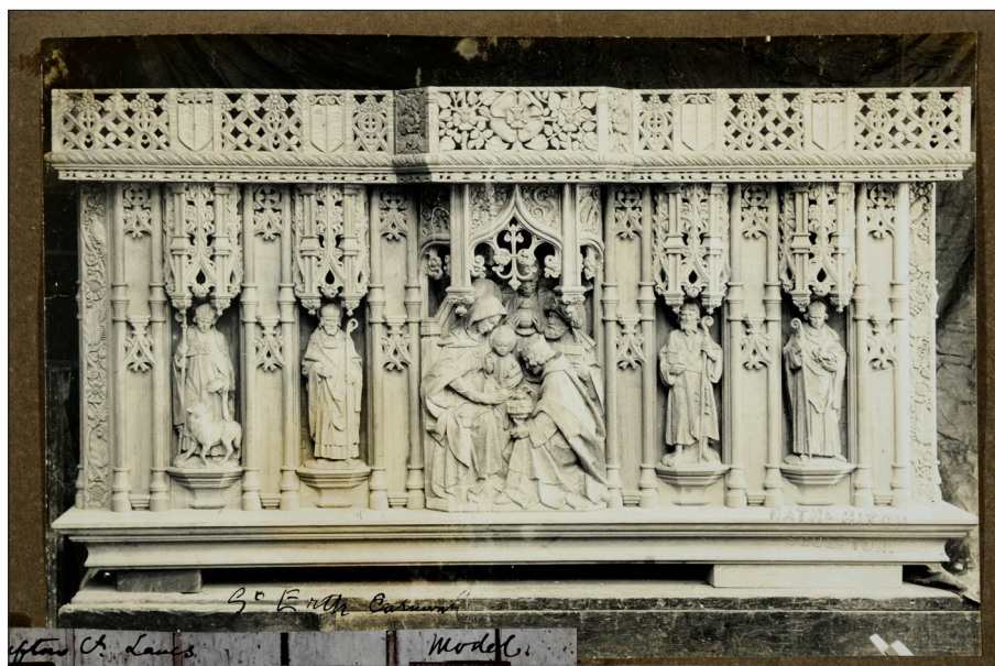
Fig. 7: Nathaniel Hitch, Photograph of the completed stone reredos for St Erth's parish church in Cornwall. 1999.1 Photograph album of the sculpture of Nathaniel Hitch and others, c. 1890–1930, Henry Moore Institute.