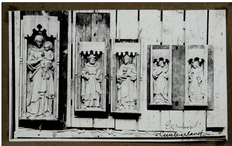
Fig. 4: Nathaniel Hitch, Photograph of a clay and wood model for the reredos for the church of St Mary & St Michael's in Egremont, Cumbria. 1999.1 Photograph album of the sculpture of Nathaniel Hitch and others, c. 1890–1930, Henry Moore Institute.