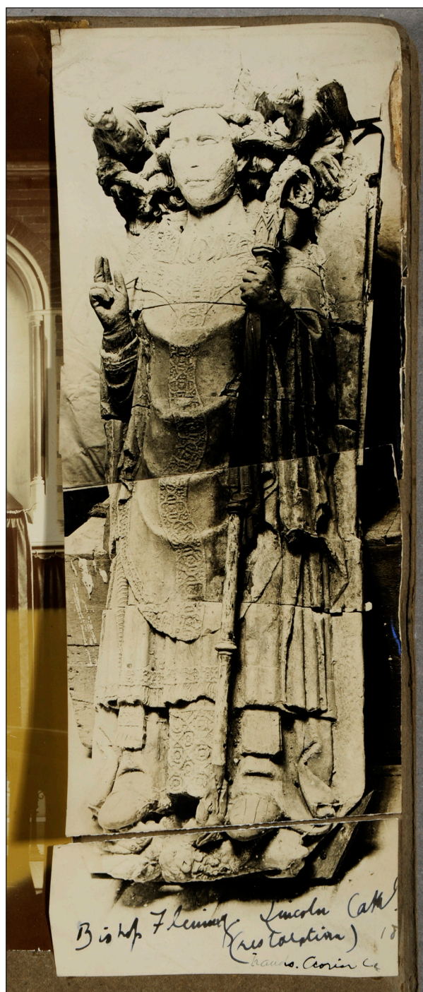
Fig. 3: Nathaniel Hitch, Photograph annotated 'Bishop Fleming, Lincoln Cathedral (restoration) hands. Crozier'. 1999.1 Photograph album of the sculpture of Nathaniel Hitch and others, c. 1890–1930, Henry Moore Institute.