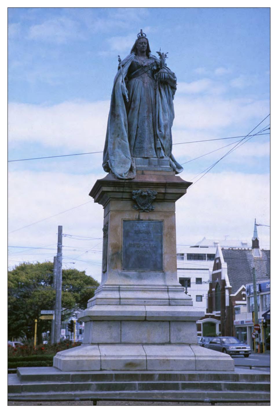
Fig. 6 : Alfred Drury, Queen Victoria, 1901–05. Cambridge Terrace and Kent Terrace, Wellington.