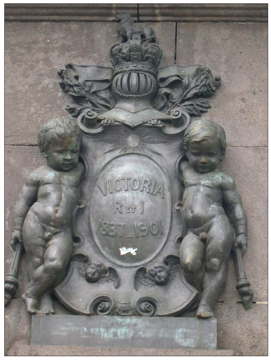
Fig. g : Herbert Hampton, detail from Queen Victoria , 1901–05. Queens Gardens, Dunedin. Wikimedia Commons.