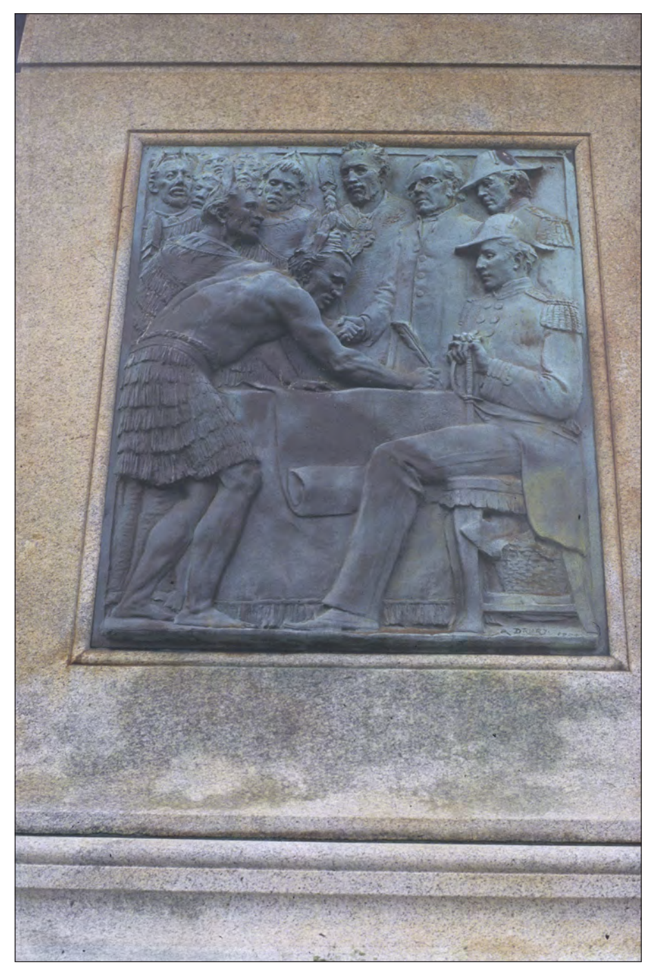
Fig. 7: Alfred Drury, The Signing of the Treaty of Waitangi , detail from Queen Victoria . Cambridge Terrace and Kent Terrace, Wellington. The Author.