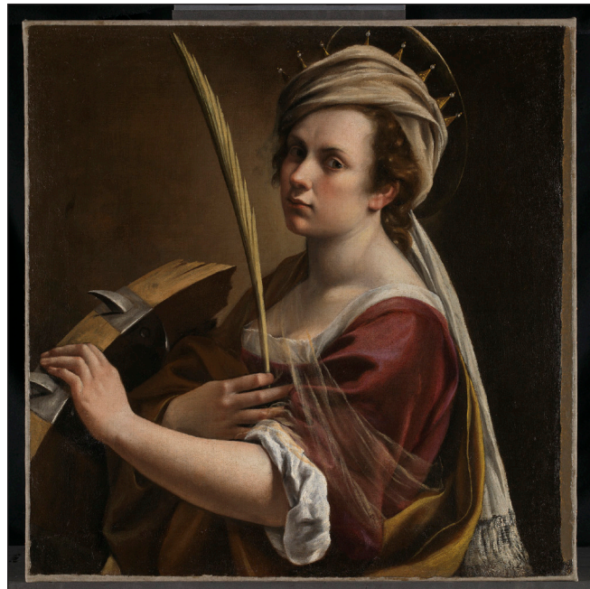
Fig. 1: Artemisia Gentileschi, Self-Portrait as Saint Catherine of Alexandria , c. 1615–17, oil on canvas, 71.4 × 69 cm.

The National Gallery's recent acquisition of Artemisia Gentileschi's Self-Portrait as Saint Catherine of Alexandria (Fig. 1) takes the number of works by female artists in the permanent collection to twenty-one. 1 Artists represented at the National Gallery include Henriette Browne , Berthe Morisot , Rachel Ruysch , Rosa Bonheur , Catharina van Hemessen , Elisabeth Louise