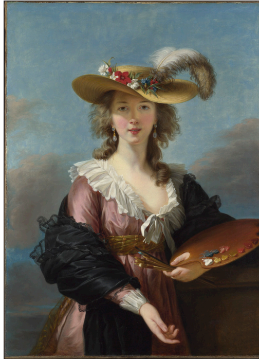
Fig. 2: Elisabeth Vigée-Lebrun, Self-Portrait in a Straw Hat, after 1782, oil on canvas, 97.8 × 70.5 cm.

jeopardy. When called before the Revolutionary authorities to justify her absence, her husband explained that she had gone to Italy to learn how to perfect her art, despite the fact that she'd been earning an extremely successful living as an artist for some fifteen years!