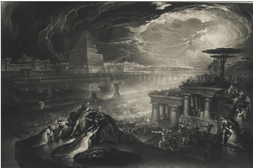
Fig. 4: John Martin, The Fall of Babylon, 1831, mezzotint with etching, 46.4 × 71.9 cm.