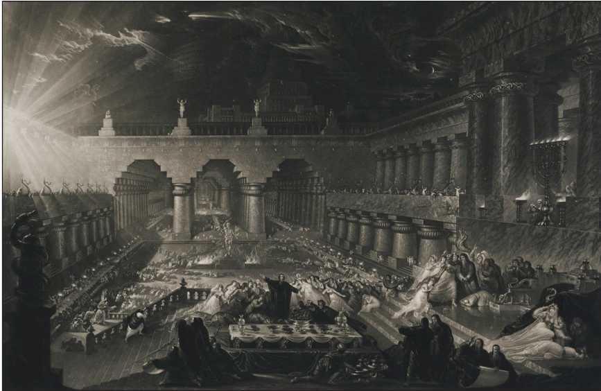
Fig. 3: John Martin, Belshazzar's Feast , 1826, mezzotint with etching, 54.4 × 74.2 cm.