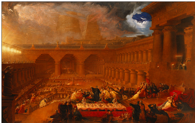
Fig. 1: John Martin, Belshazzar's Feast , 1820, oil on canvas, 160 × 249 cm, private collection.

In 2011–12 Tate Britain mounted a major exhibition dedicated to the painter and printmaker John Martin (1789–1854). His most sensational painting, Belshazzar's Feast (1820), was displayed alongside works illustrating how others capitalized on its success through imitation and copying ( Fig. 1 ). These were all prints of some form except one, the 'most striking', painted on a large piece of glass ( Fig. 2 ). 1 As a curiosity closely associated with Martin's early career as a glass painter, this has a long-established presence within the written history of Martin's work. 2 In the accompanying publication the