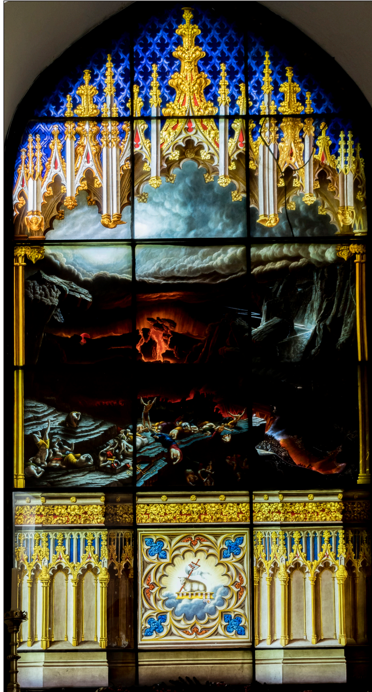
Fig. 6: William Collins (signed by), Opening of the Sixth Seal , after Francis Danby, c. 1835–45, east window, St Andrew's, Redbourne, Lincolnshire.