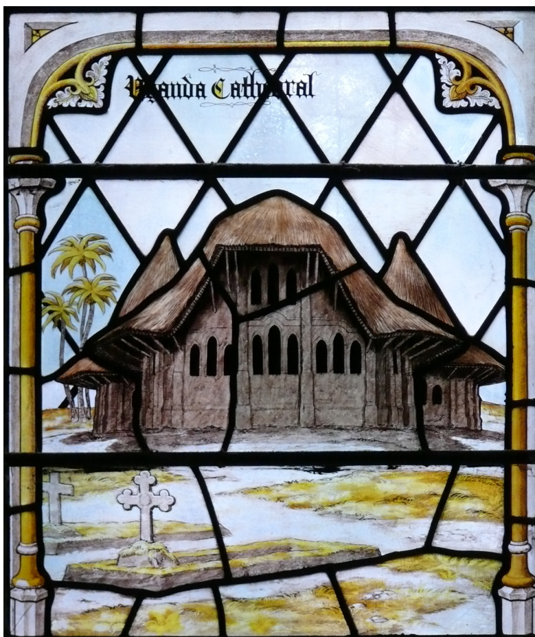
Fig. 12: Detail from east window at St Aldates church, Oxford, c. 1905, showing Church Missionary Society cathedral atop Namirembe Hill, Kampala. This is a rare but accurate record of an extraordinary example of nineteenth-century missionary architecture in Africa.

emphasized that such a sense of duty was not only willingly acknowledged but also delicately poised, oftentimes requiring considerable sacrifice. In other words, people (in some cases, many people) were willing to die for it. Such windows were therefore an effective device in reminding those who looked upon them of the gravitas of that responsibility and the sacrifices it required. In case those sitting comfortably at home had forgotten what made Britain 'Great', such imagery would serve as a type of aide-memoire to what was actually involved in facilitating and maintaining the spiritual and civilizational basis of British political power across the globe.