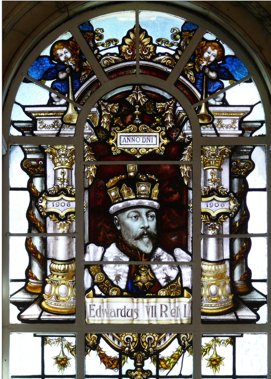
Fig. 6: King Edward VII Window, grand staircase, Belfast City Hall, c. 1905, Ward & Partners, Belfast. Photographed by G. A. Bremner. The hall and surrounds are replete with the symbolism of unionism. This particular window styles Edward as both king and emperor.