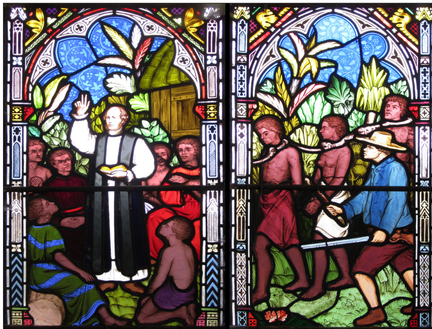
Fig. 10 : Details from the memorial window to Charles Mackenzie, south aisle east window, Haslingfield church, Cambridgeshire, 1869, to designs by Frederick Preedy. Mackenzie was famed as the first bishop of the Universities' Mission to Central Africa, who died in the field of disease after only one year. His mission was celebrated in Britain for its efforts at stamping out the East African slave trade. These details of the window show Mackenzie preaching to local indigenes (the principal objective of his mission) and barbarous scenes of the East African slave trade, which Mackenzie and his co-labourers worked to frustrate and abolish, later in cooperation with the British government at Zanzibar. The sources for the depiction of slaves in this context were circulating in newspapers, journals, and travel accounts of the time, such as David Livingstone's Narrative of an Expedition to the Zambesi and its Tributaries (1865).

It is worth pondering for a moment if, and to what extent, such windows were accurate in their depictions of the people and places they depicted; or, whether this even matters. Extant portraits of Mackenzie show that the Haslingfield window is a good likeness, but what about