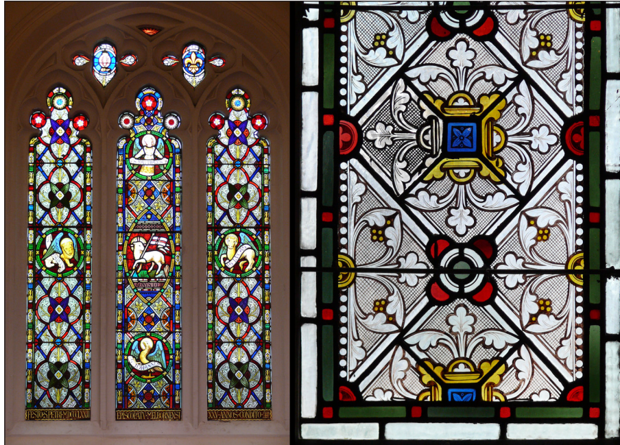
Fig. 13: (left): Bishop's window, nave (north wall), Christ Church Anglican church, Geelong, Victoria, 1872, by Ferguson & Urie. This window represents the relatively widespread theme in the British colonial world of evangelism; (right): Detail of window from Old St Paul's Cathedral, Wellington, New Zealand, c. 1874, likely by Lavers & Barraud. Early in the history of colonial stained glass, particularly where resources were limited, churches, when they could afford stained glass of any kind, opted for grisaille-style patterning for its medieval associations, which became quite common and can be found throughout the British colonial world.

denominations across the British world. In the colonies the types of theme one comes across varies, and in parish churches in towns and cities (especially in settler colonies) they include anything one might normally find in a Victorian parish church in Britain. Missionary memorial windows are also found on occasion in such places. In the town of Milawa in northern Victoria (Australia), for instance, there is a window dedicated to Bishop John Coleridge Patteson, the 'missionary martyr' of Melanesia. The reasons for its location here are unclear, but it contains scenes of St Paul preaching to the Athenians, and St Stephen being stoned: both biblical references to Patteson's endeavours, with the latter alluding to his death at the hands of Solomon Islanders in 1871.