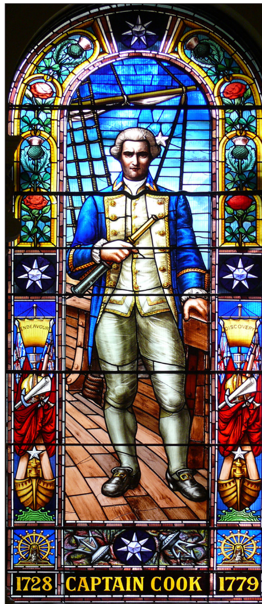
Fig. 2: Captain Cook Window, main staircase, Town Hall, Sydney, 1889, by the French designer Lucien Henry for local, Sydney-based manufacturers Goodlet & Smith. This window is paired with another depicting an allegory of New South Wales, showing a female figure standing on a globe inscribed 'Oceania' and draped in Union Flag-inspired robes. She also sports ram horns emerging from either side of her head, indicating the importance of the wool industry to the economy of New South Wales. Both windows together communicate a colonial foundation narrative of 'discovery', industry, and prosperity in the new world — 'Australia Felix'.