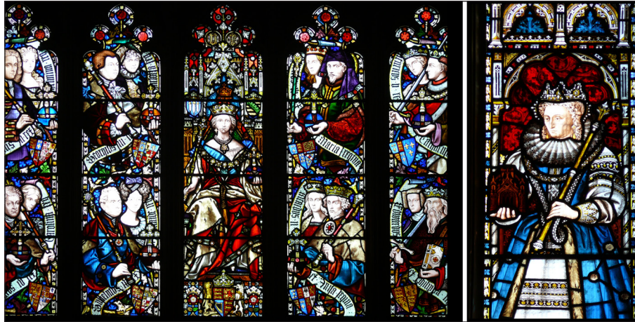
Fig. 5: ( left): Detail of panels from the Royal Window, Great Hall, University of Sydney, c. 1859, by Clayton & Bell. This window depicts the lineage of the ‘kings and queens of Britain’, dating back to William the Conqueror. Such displays of regal history worked to reinforce connections of culture and government between Britain and its colonial empire, playing into the idea of ‘Greater Britain’ and the commonly held notion that Britain’s settler colonies were so many ‘little England’s beyond the seas’; ( right): Detail of panels from the Oxford Window, Great Hall, University of Sydney, c. 1859, by Clayton & Bell. The window as a whole indexes the founders of the colleges of the University of Oxford up to the beginning of the seventeenth century. Like the Royal Window, this one, and the ‘Cambridge Window’ at the opposite end of the hall, attempts to establish the University of Sydney as a natural colonial extension of the ancient English university tradition. This detail shows Queen Elizabeth I as founder of Jesus College (1571).

itself was based in part on that of the ancient universities of Scotland, not England. 17