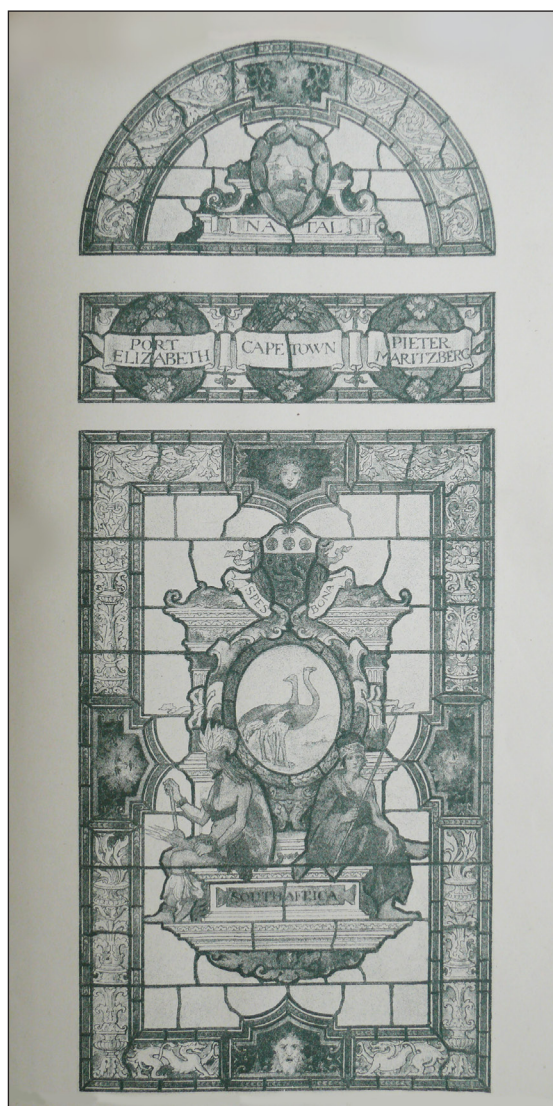
Fig. 7: Design of window for the Imperial Institute, South Kensington, London, 1892, by Clement Heaton. From the Builder , 29 October 1892. The original decorative scheme for the Imperial Institute in South Kensington is another example of such a programmatic regime in the Victorian era. This design for a window in the building represents the colonies of South Africa and was displayed at the Royal Academy Exhibition of 1892. It sat alongside other similar windows celebrating Britain's major colonies of settlement, such as Canada and Australasia. The Imperial Institute, as the name suggests, was itself a supreme organ of empire, designed to promote the idea of better and further cooperation between Britain and its colonies. The building was even constructed of materials from across the British colonial world and was to be encrusted with decorative relief sculpture depicting the peoples and resources of the British Empire.