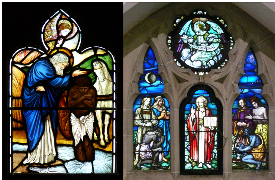
Fig. 14: (left): Philip baptizing the eunuch, St Barnabas's Anglican church, Norfolk Island, c. 1880, designed by Edward Burne-Jones and made by Morris & Co. Photographed by G. A. Bremner. Since the window is on Norfolk Island, the centre of the Church of England's Melanesian Mission, there is an obvious context for this image. However, much like the other windows mentioned that depict non-European indigenes, such scenery had broader connotations in representing the idea of Christian conversion in the wider world, especially in non-European, non-Christian lands; (right): Window depicting the universal message of Christ, northern aisle, St John's Anglican church, Toorak, Melbourne, c. 1920, possibly by Ferguson & Urie. Photographed by G. A. Bremner. Similar to the windows at St Barnabas's and St Ebbe's mentioned above, this window is explicit in its depiction of humankind as a diverse collection of racial types, including a locational reference to an Australian aboriginal, who cowers in the bottom right. The lower pane of the central panel to this window pulls forward on accordion-style hinges, while the upper circular panel rotates on its axis — both designed to allow ventilation. Such devices remind us of the different and more extreme climates in which modern Christian churches were built, allowing stained glass windows to serve a purpose other than as memorials or decoration. I wish to thank the Rev. Peter French, incumbent of St John's, for information on this window.

as was indeed the case in many of Britain's colonies at the time. Moreover, being themes that were also common in stained glass at home, they may be seen as having extended a sense of continuity between the mother country and its colonies. One particularly beautiful if remote rendition of the sacrament of baptism in stained glass can be found in the Anglican church of St Barnabas, Norfolk Island. This window, along with the others in the church, was designed and produced by Morris & Co. ( Fig. 14 left ). It is notable for its depiction of the baptized as a non-European of dark complexion, in this