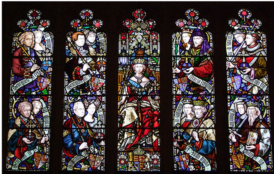
Fig. 8: Clayton & Bell, Royal window, Great Hall, University of Sydney, c. 1859.