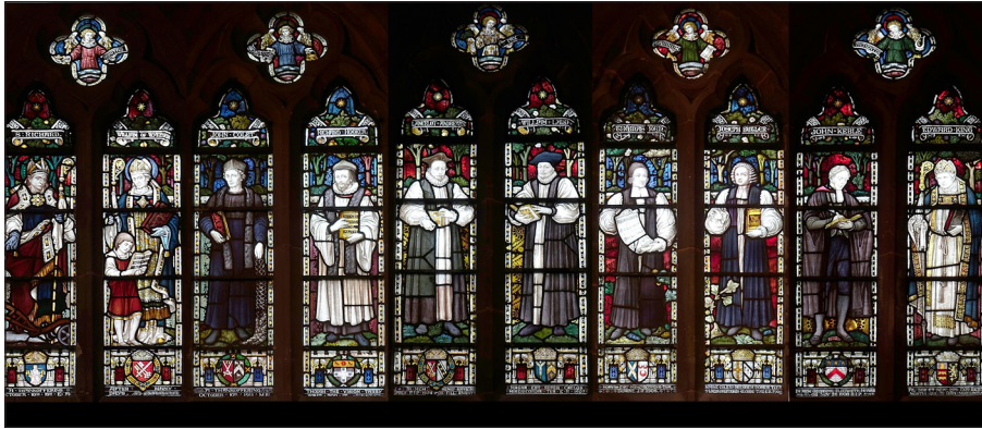
Fig. 3: Clayton & Bell, Nave north aisle windows, St John the Divine, Friern Barnet, 1908–11. From left (west) to right (east): ‘S: Richard’ of Chichester and William of Wykeham; John Colet and Richard Hooker; Lancelot Andrewes and William Laud; Thomas Ken and Joseph Butler; John Keble and Edward King. Among the most common arrangements for such schemes, the paired figures recall patron saints posed on tall, thin altarpieces. The predellae or platforms on which they stand are also reminiscent of altars and are characteristic of the genre: in this scheme they display coats of arms. Note also the mottoes and dedicatory inscriptions along the bottoms of the windows: evidence that this was a scheme completed through many different donations.

educationalists are represented in the shape of William of Wykeham, founder of Winchester College, and John Colet, founder of St Paul’s School. From the Reformation onwards the story becomes still more decidedly partisan: from the seventeenth century, Richard Hooker, Lancelot Andrewes, William Laud, and the (eventual) non-juror, Thomas Ken; from the eighteenth, the anti-deist Richard Butler; from the nineteenth, the Tractarian and poet John Keble and the saintly Edward King, Bishop of Lincoln, hailed as a ‘martyr’ by Anglo-Catholics after his trial between 1888 and 1890 for ‘ritualistic practices’ contrary to the Book of Common Prayer ( Fig. 3 ). 25 Above the sanctuary, a depiction of the Adoration of the Lamb unites the present with the past and places the national tale told below against a cosmic backdrop. The communion of saints it portrays was very up to date, reflecting Britain’s imperial reach and missionary activities across the globe. Alongside elders, apostles, Old Testament figures, bishops, kings, and crusaders among the ‘ten thousand times ten thousand’ gathered around the throne (Revelation 5. 11), are modern representatives of different nations ( Fig. 4 ).