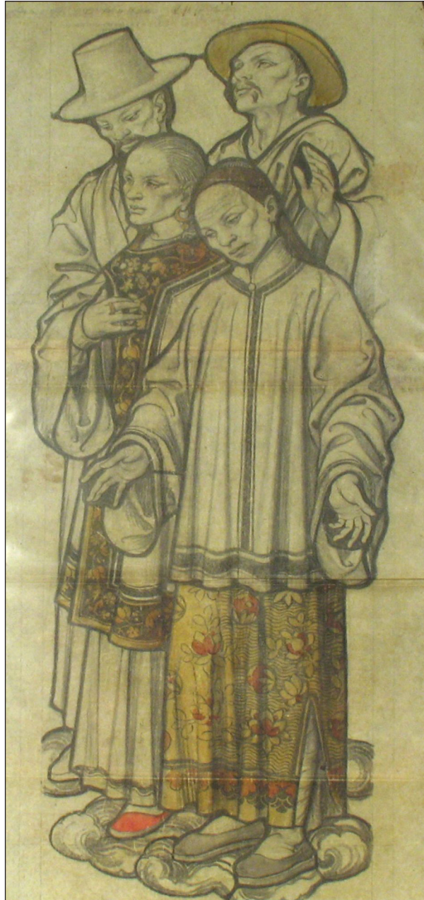
Fig. 4: Clayton & Bell, St John the Divine, Friern Barnet, sketch, 1902?, installed 1906. Part of a set of eleven two-light windows in the apse and east end depicting the Adoration of the Lamb. The figures, who are recognizably Chinese, stand on clouds and look towards the Lamb. Given the date and the theme of the window it is likely that they represent Christian martyrs killed in the recent Boxer Rebellion.