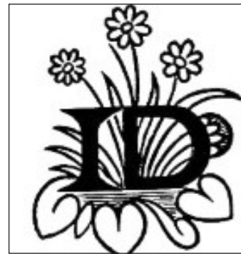
Fig. 2: Isadora Duncan's monogram, Isadora Duncan Dance Foundation < https://isadoraduncan.org/wp-content/uploads/2017/03/Prospectus.pdf > [accessed 26 October 2022].

The family copy of Botticelli's painting may have been an Arundel Society chromolithograph, released in 1888, some eighteen years after the chromolithograph of The Birth of Venus , which coincided with Walter Pater's essay on Botticelli and the craze for the artist it generated. 6 More likely it was an Alinari photograph, or a line engraving, which began to proliferate at about the same time. Isadora's monogram (Fig. 2) clearly springs from the flowered ground of Botticelli's painting, which contains more than five hundred different species of flowers, trees, and grasses. 7 The association of women with flowers, from Proserpine to Baudelaire, has powerful symbolic value: a creature transformed into a flower, a fast-fading rose, or a nymph deflowered. Isadora is herself that flower, the generator of a pagan revival of ancient dance, just as Botticelli's painting has often been seen as the very embodiment of the Renaissance with its fusion of the pagan and the Christian, the naked and the clothed, the very breath of the Rinascimento .