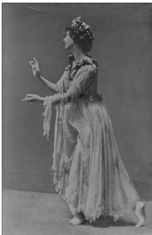
Fig. 3: Isadora Duncan Dancing in Primavera, 1900, photograph

Isadora responded creatively to the myth, propagated by Walter Pater, Aby Warburg, and Emil Jacobsen of the beautiful Simonetta Vespucci, dead from tuberculosis at the age of twenty-two in 1476, as a model whose haunting presence runs through several of Botticelli's paintings. 9 The merging of self and Florentine myth is intricate: the floral harbinger of spring is also toying with the ephemerality of the very youth she evokes, almost in premonition of Duncan's own early death in 1927 when the entanglement of her trademark floating garments with the wheels of a car brought her life to a sudden end. We have evidence of her Flora outfit in both image (Fig. 3) and in the words of a contemporary critic: