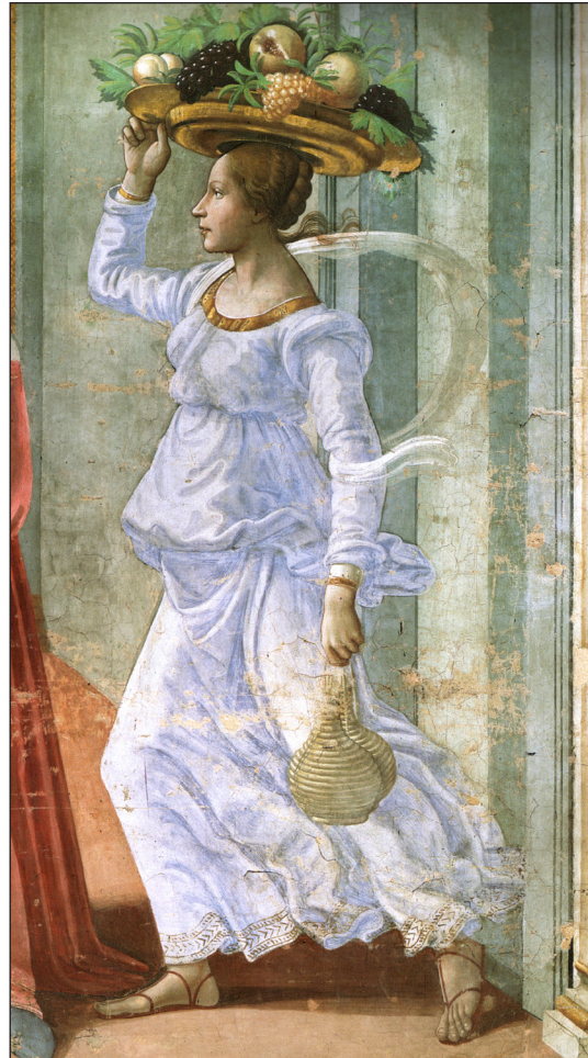
Fig. 6: Domenico Ghirlandaio, Servant maid, detail from a fresco depicting the birth of John the Baptist, 1480s, Tornabuoni Chapel, Santa Maria Novella, Florence.

philosophy the image fulfilled the same role in the collective mind as the “engram” fulfilled in the nervous system of the individual. It represents an “energy charge” that becomes effective through contact’ (p. 287).