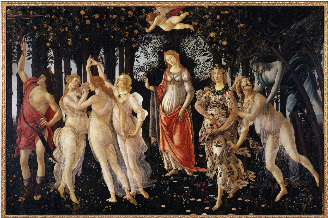
Fig. 1: Sandro Botticelli, Primavera , 1477–82, tempera on panel, 203 × 314 cm, Uffizi, Florence.

it came to me what a wonderful movement there was in that picture, and how each figure through that movement told the story of its new life. And then, as Mother played Mendelssohn's Spring Song, as if by the impulse of a gentle wind, the daisies in the grass would sway and the figures in the picture would move. 2