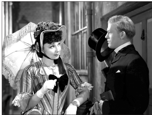
Fig. 2: Googie Withers (Pearl) and Gordon Jackson (David), publicity still for Pink String and Sealing Wax (UK, 1945; dir. Robert Hamer).

with the local petty crook, Dan. David quickly becomes infatuated with Pearl and when he finds her with a cut hand, the result of a blow from her husband, he takes her to his father's pharmacy to dress the wound (Fig. 2). Seeking to impress her, he shows her the poisons on the shelves, including strychnine, which he tells her produces the same symptoms as lockjaw. Pearl steals some of the strychnine and uses it to poison her husband, whose death is attributed to lockjaw. Pearl's hopes of being with Dan are dashed, however,