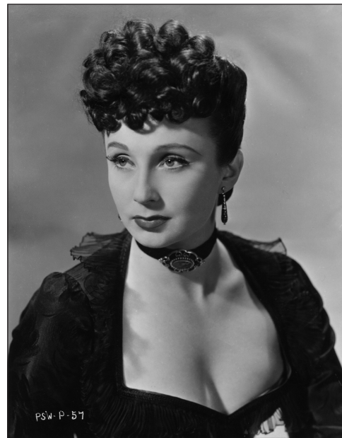
Fig. 5: Googie Withers (Pearl), publicity still for Pink String and Sealing Wax , small pressbook, unpaginated, PBS 41317. British Film Institute National Archive, Pressbooks Collection.

Withers and Victorian paraphernalia were the two greatest selling points of the film. The Ealing Studios pressbook reproduced publicity shots of Pearl (Fig. 5) and advised: 'The Victorian period of the film is a primary angle on all exploitation matter', suggesting link-ups with outfitters, jewellers, and stationers and also coming up with the idea that if there