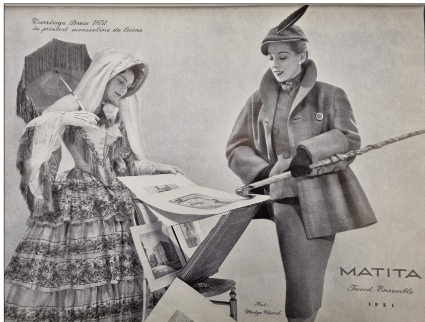
Fig. 6: Advertisement for Matita 'Tweed Ensemble', Vogue, July 1951.