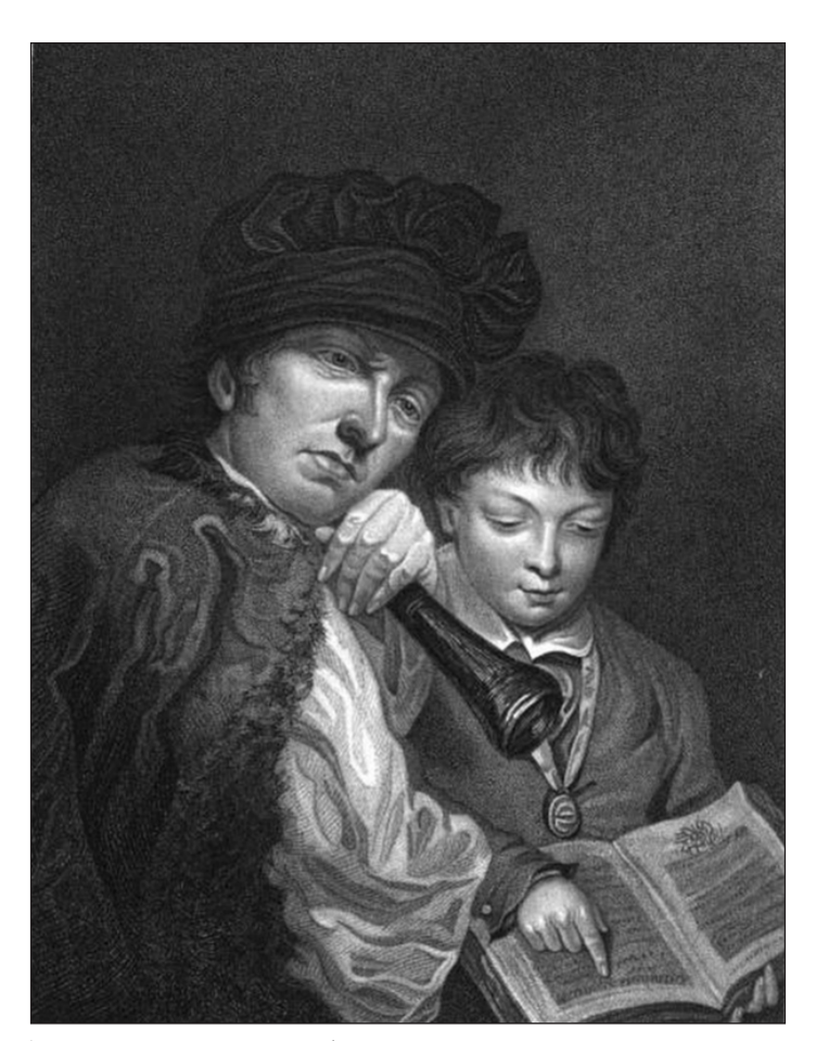
Fig. 1: 'The Deaf Schoolmaster', illustrated and engraved by Henry Meyer.

light and shade to appear on the steel plate than ruled engraving: a velvety black and halftones that can be gradated, patches of white where the plate has been scraped and no ink has touched endow the plate with expressive drama and affect. Though, as Geoffrey Wakeman points out, 'steel could not give the rich tones that were so highly prized in copper', steel mezzotint is distinctively different from ruled engraving in its contrastive function.<sup>20</sup> The extremes of black and white dramatize the difference between seeing and hearing, one sense foregrounding the disability of the other. The darkness of the ear trumpet, which cuts diagonally across the centre of the picture, points to the words on the page of the book that cannot be heard but only seen. It insists on the teacher's disability and the disjunction between sight and sound. The ear trumpet's technology of listening becomes a placeholder for the reader.