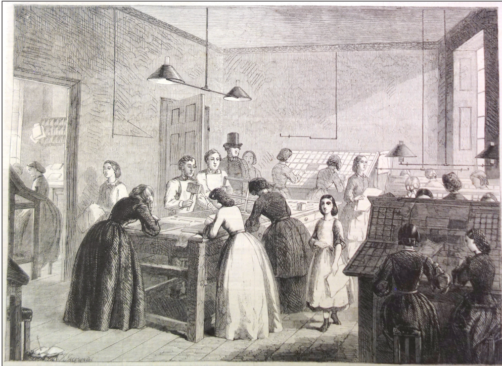
Fig. 1: 'Printing-Office (the Victoria Press) in Great Coram-Street, for the Employment of Women as Compositors', Illustrated London News , 15 June 1861, p. 555.