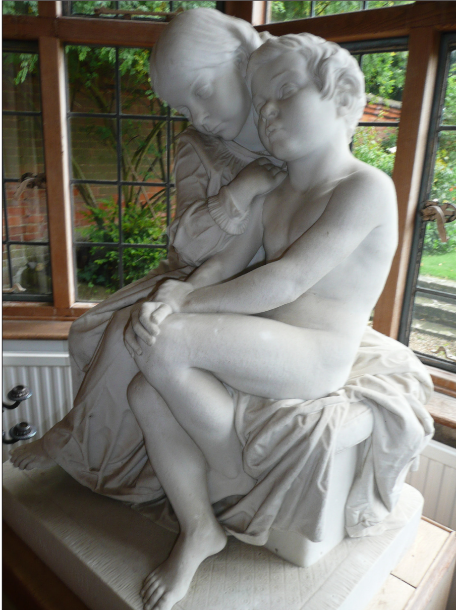
Fig. 1: Thomas Woolner, Constance and Arthur, or Brother and Sister , 1857–62, marble, private collection.

what Vanessa Warne refers to as ‘the lowly status of touch in a hierarchically conceived human sensorium’. 2 However, this case study is centred as