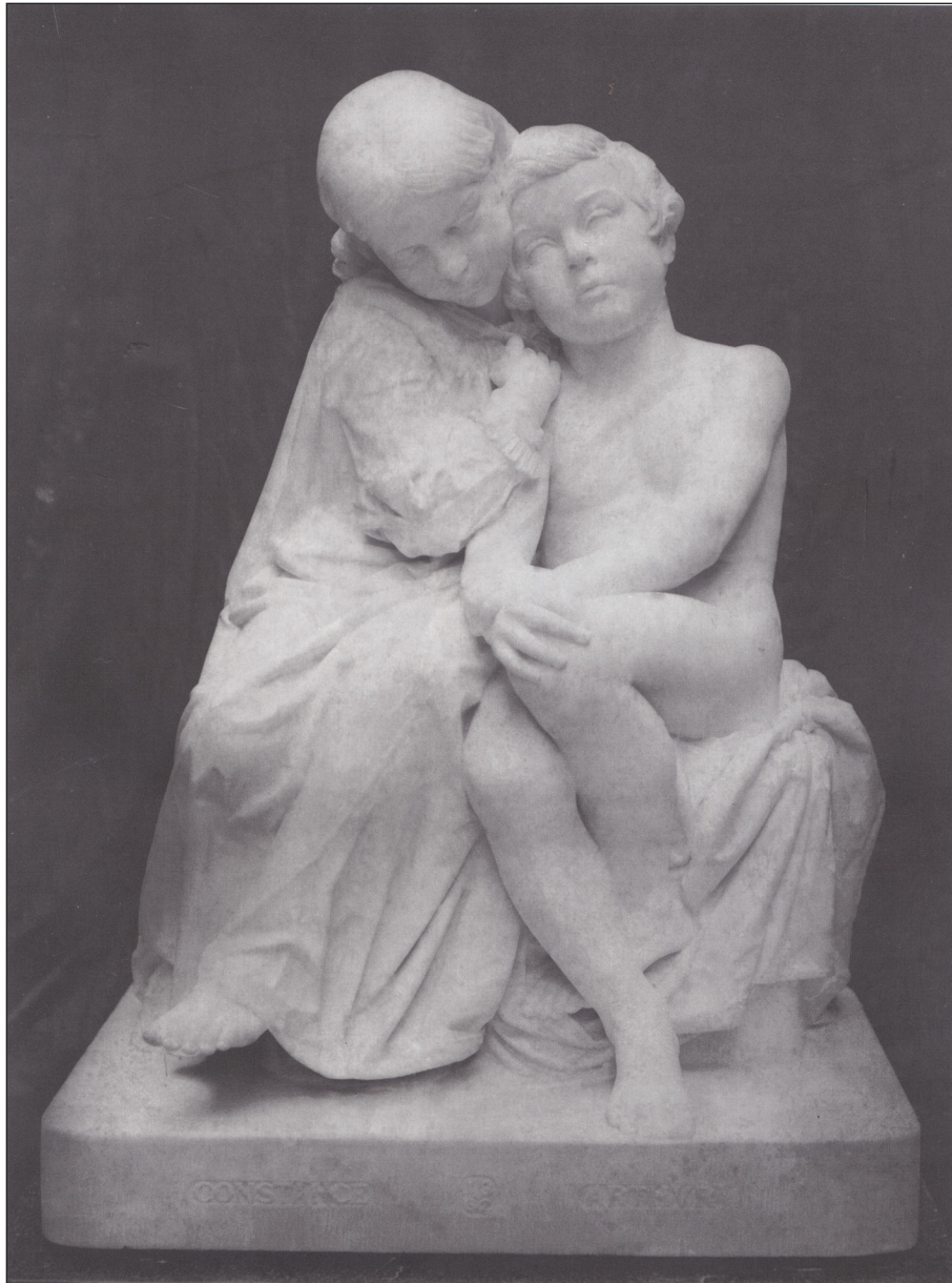
Fig. 3: London Stereoscopic Company, photograph of 'Brother and Sister' (1857–62) by Thomas Woolner, London International Exhibition, 1862. Modern copy of 1862 photograph.