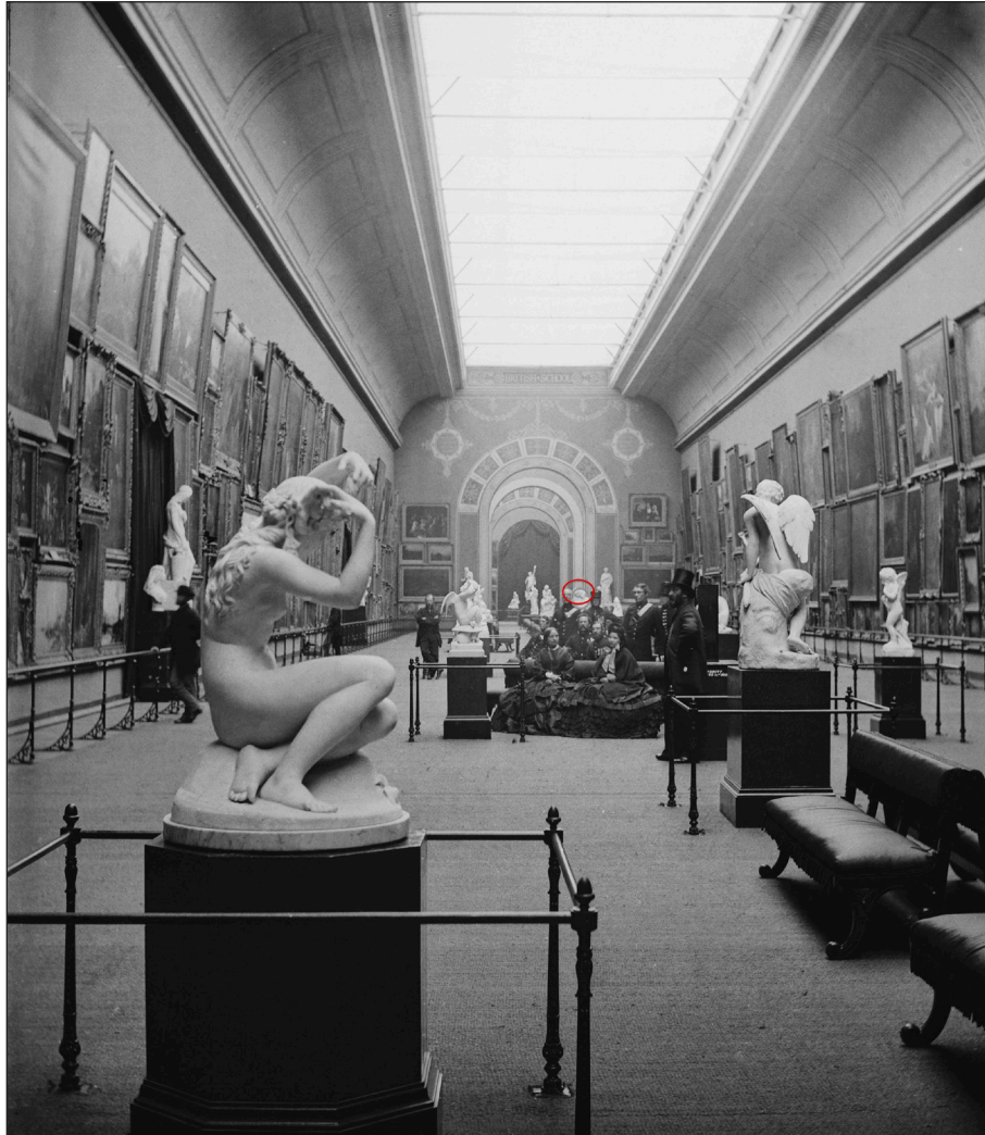
Fig. 5: London Stereoscopic Company, photograph of the English Picture Gallery, London International Exhibition, 1862. Modern copy of 1862 photograph. The statue is in the distance, highlighted in red.

Another compendium simply offers a dizzying list of the sculptures on display, ranging from ‘marble statues of Mercury, and of Venus tying her sandals’ to ‘Gibson’s TINTED VENUS, Pandora and Cupid’ and ‘Lord Lyon’s monument for St Paul’s’. 23 Although this particular catalogue seems comprehensive, it overlooks Woolner’s marble group, which was praised by