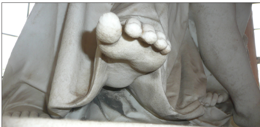
Fig. 2: Detail from Constance and Arthur (Fig. 1).

I was also moved by the act of touch itself. It was partly the odd contrast between the appearance of life and the coldness of stone — but also the rarity of the experience. It struck me that in my academic reflections on ‘feeling and the arts’, how little physical ‘feeling’ I had actually done — how little space I gave to the question of physical touch during the course of my research into the emotions. In this sense, I am not unusual. ‘Touch’, as Constance Classen argues, ‘is not so distant from thought as we might imagine’, but, as the editorial of a recent issue of 19 on the ‘tactile imagination’ demonstrates, it is often neglected as a mode of understanding. ‘In the field of nineteenth-century studies’, Heather Tilley argues, ‘touch (and other sensory modalities) have been largely overlooked.’ 6