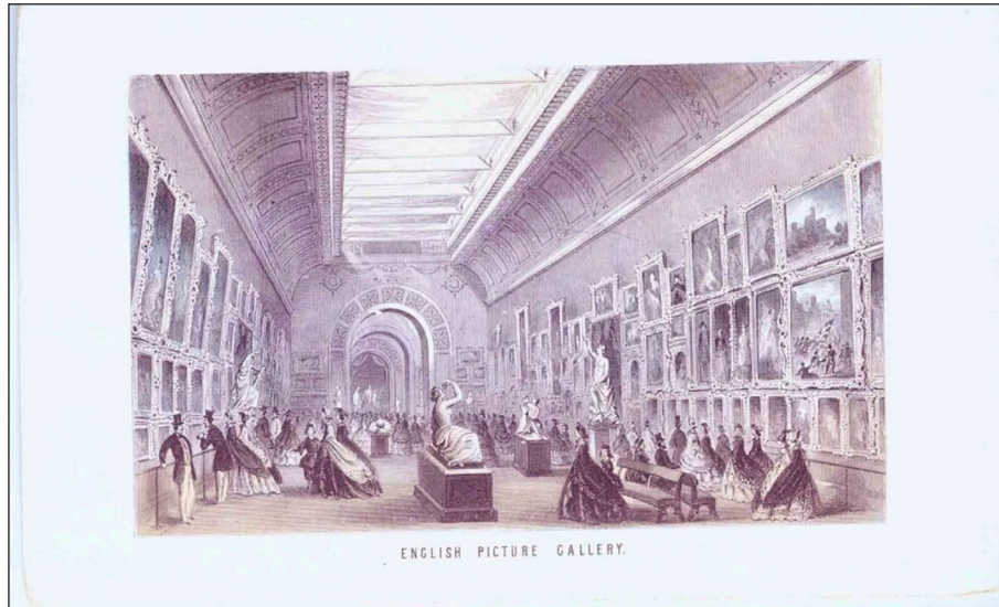
Fig. 6: Views of the International Exhibition (London: Nelson, 1862), p. 10.

other contemporary commentators as one which ‘visitors would do well to notice’ ( A Plain Guide , p. 50). Singled out for special illustration by Cassell’s Illustrated Family Paper Exhibitor , the statue is described as ‘at once tender, natural and graceful [. . .]. The design cannot fail to delight, not only artists and connoisseurs, but all who gaze upon the group.’ 24