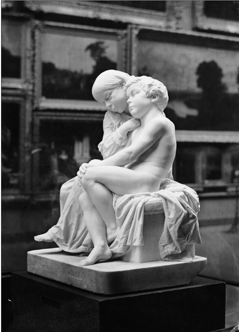
Fig. 4: London Stereoscopic Company, photograph of 'Brother and Sister' (1857–62) by Thomas Woolner, London International Exhibition, 1862. Modern copy of 1862 photograph. William England, Hulton Archive © Getty Images UK Ltd.