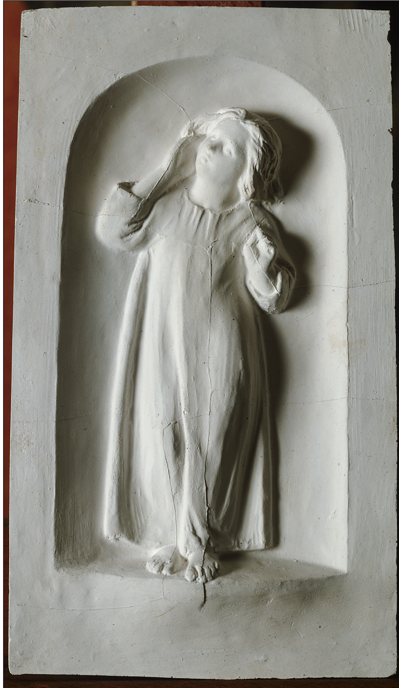
Fig. 8: Thomas Woolner, Listening Boy , c. 1874, plaster relief.