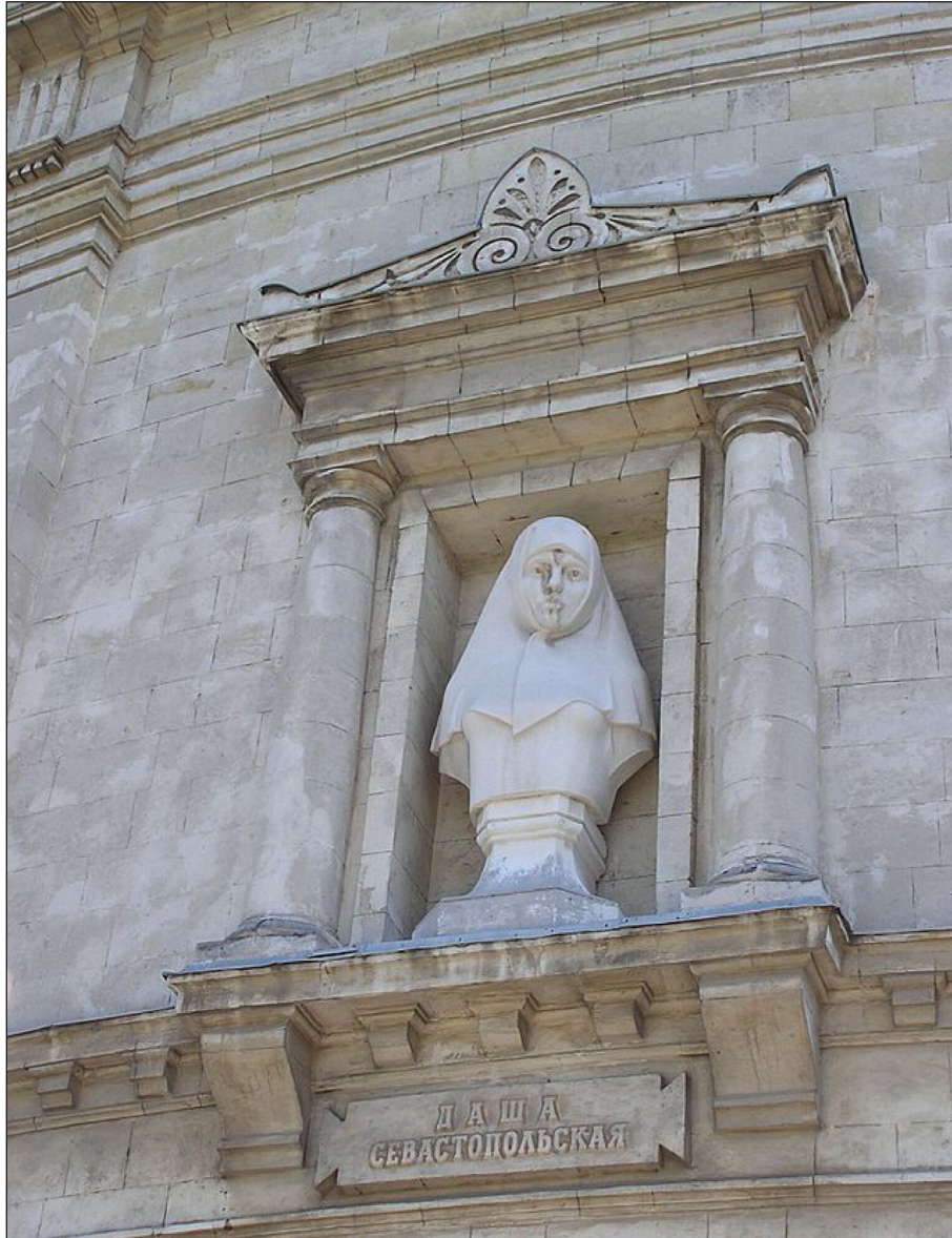
Fig. 3: Bust of Dasha Sevastopolskaya on the Panorama Museum, Sebastopol.

Dasha, however, was serving on her own ground, and the involvement of British civilians is far more significant. Few could emulate Seacole and go to Crimea themselves, but the scale of the public response to Russell's reports was unprecedented, and marks the beginning of a shift in consciousness which would change forever the way in which the British