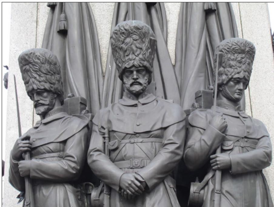
Fig. 5: John Bell, Detail from Crimean War Memorial, Waterloo Place, London, 1861. A. L. Berridge.

But it still simmers in the public mind, and we can see its legacy clearly in the changing face of Britain's war memorials. Major commemorations before the 1850s tend to be either grand architectural features or statues of the commanders in suitably warlike poses, but the focus of the Crimean War Memorial in Waterloo Place is the men themselves. The reason may simply be that John Bell's work was originally tended specifically as a memorial to the Guards, but the presentation is strikingly different from any that preceded it, and has set the pattern for all that would follow ( Fig. 5 ). There is nothing jubilant about these figures. They are grim, even sombre, and the eyes of the outer pair are actually downcast. The sculpture honours sacrifice rather than victory, and these figures make clear exactly whose it was.