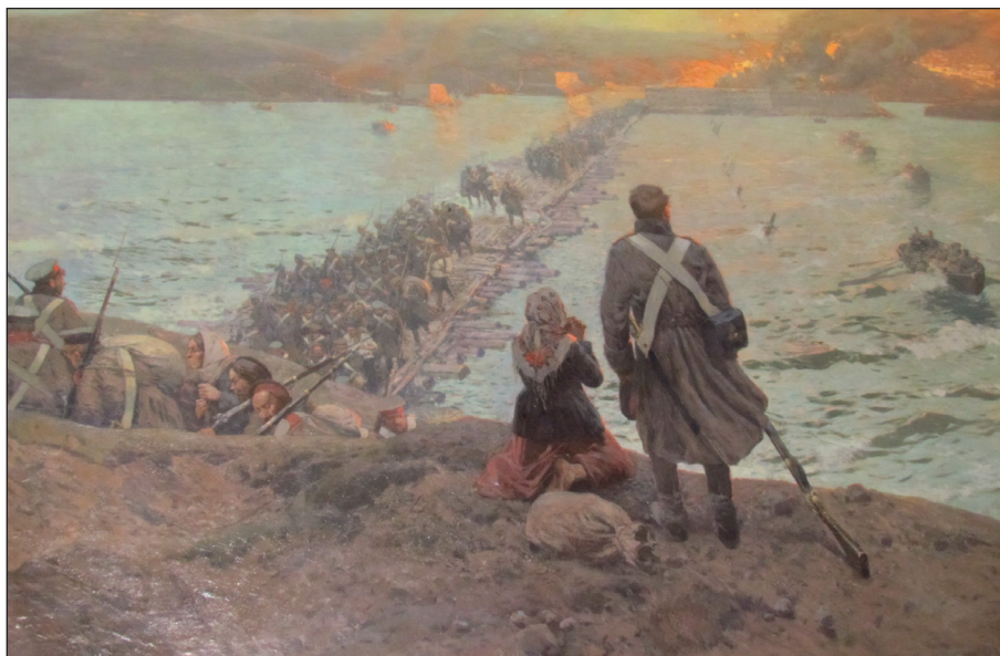
Fig. 6: Franz Roubaud, Last Look, 1901–02. Museum of the Black Sea Fleet History, Sebastopol.

Even that withdrawal has a heroic drama to it. In the course of a single night, the entire population of the town was secretly and silently evacuated over a hastily constructed floating bridge while their homes were set ablaze behind them. It is a great human story, and as I stood in front of Roubaud's moving Last Look in Sebastopol I could not help a pang of novelist's regret that I was writing from the point of view of the British rather than the Russians ( Fig. 6 ).