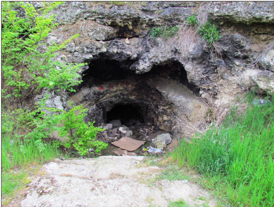
Fig. 7: Opening to countermine preserved at Number 4 Bastion, Sebastopol. A. L. Berridge.

For if the ‘Siege of Sebastopol’ struggles to find popular appeal, the ‘Defence of Sebastopol’ does not. Crimea itself bristles with memorials and museums to the nineteenth-century conflict, and while the supposed victors of the war have quietly forgotten it, the losers celebrate it to this day. Much of Sebastopol was destroyed in the Second World War but the site of every bastion has been marked and memorialized, and even the harbour contains a monument to the sunken ships that saved the town from the Allied Fleet in 1854. The central feature is Number 4 Bastion (the Flagstaff) where the gabion defences have been painstakingly recreated and openings to the original Russian countermines have been preserved. One is given special prominence, and purports to be the very sap in which Todleben crouched on 30 January 1855 to listen to the digging of the approaching French ( Fig. 7 ).