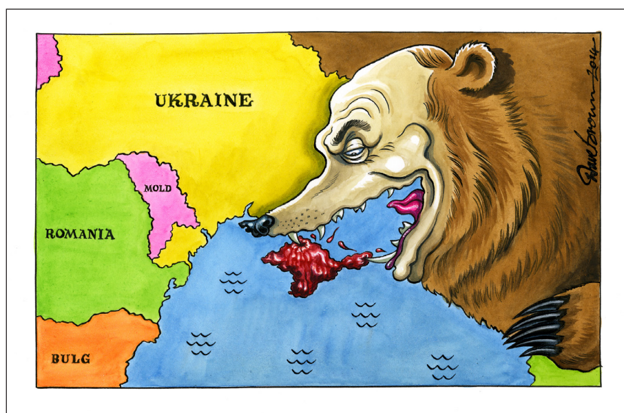
Fig. 9: © Dave Brown, Russian Bear , Independent , 18 March 2014.

There is truth in all of Richardson's criticisms. The cartoons of British Lion and Russian Bear, for instance, were indeed used to whip up aggressive war fever in Britain, and the iconography has become so deeply embedded in the national consciousness that modern cartoonists like Dave Brown of the Independent have been able to adapt them to the current Crimean crisis in full confidence that readers will recognize them for what they are ( Fig. 9 ).