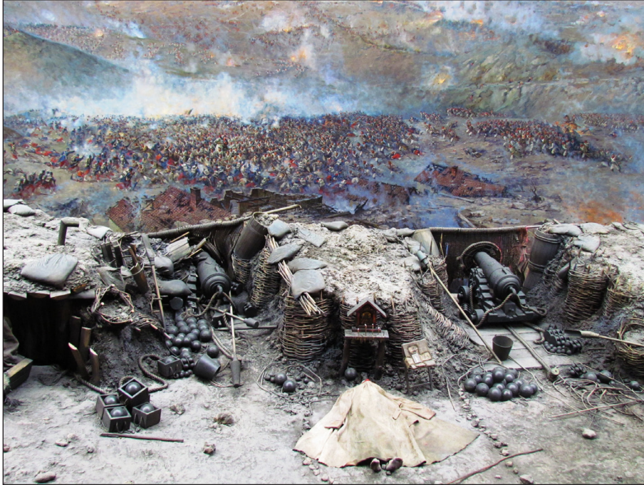
Fig. 8: Franz Roubaud, Panorama of the Heroic Defence of Sebastopol , 1905. A. L. Berridge.

To stand inside the Panorama is to understand why the Crimean War holds such a special place in Russia's national consciousness. Russian performance was as patchy as Britain's, marred by the same problems of poor commanders, dreadful communication, and inadequate supplies, but at the heart of it lies the astonishing heroism of this gallant defence. At 349 days it lasted longer even than the second siege of 1941–42 and is considered to bear its own credit for Sebastopol's official designation as a 'Hero City'.