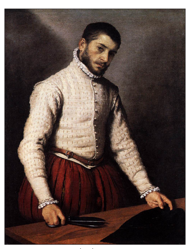
Fig. 1: Giovanni Battista Moroni, The Tailor, c. 1570, oil on canvas, 99.5 \times 77 cm, National Gallery, London. CC BY-NC-ND 4.0.

Portrait of a tailor in a white doublet with minute slashes — dark reddish nether dress — a leather belt [strap & buckle] round the end of the white dress. He stands before a table with scissors in his rt hand, & a piece of [black] cloth in the left.