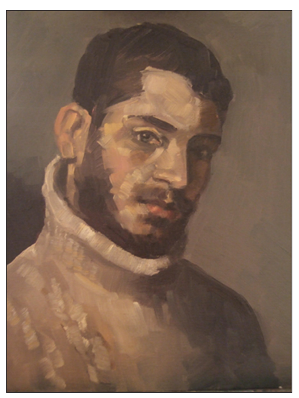
Fig. 2: Sarah Godsill, Moroni's Tailor in a Cable-Knit Sweater, 2011, watercolour <a href="http://www.eventsillustration.co.uk/2011/11/10/1040/">http://www.eventsillustration.co.uk/2011/11/10/1040/</a> [accessed 31 January 2019]. Reproduced by kind permission of the artist.

others becomes one of power and appropriation. From the austere walls in the National Gallery, Moroni's Tailor travels into the domestic sphere of the female artist who makes her living from illustrating other people's weddings. Whatever distance there might have been between the framed foreign oil painting and the female spectator has collapsed in the watercolour copy of Moroni's sitter. He has lost his profession and become the nice chap next door.