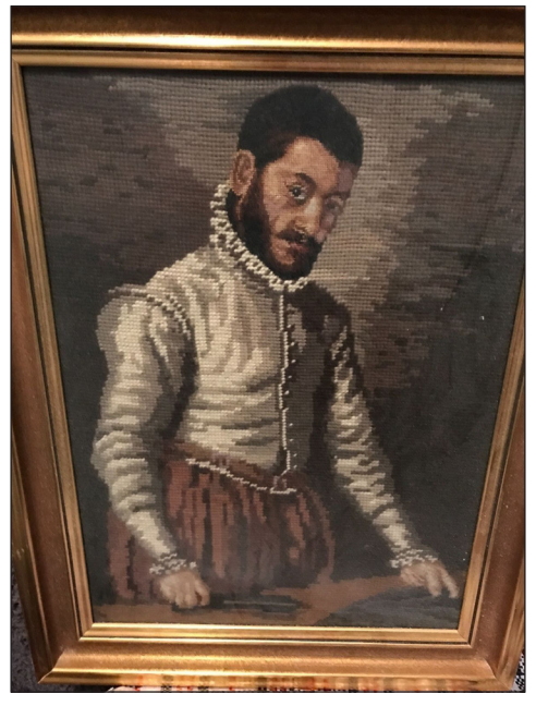
Fig. 6: Anon., Needlepoint copy of Moroni's Tailor, 20th century, 40.6 \times 29.2 cm, private collection. Reproduced by kind permission of the artist and owner.