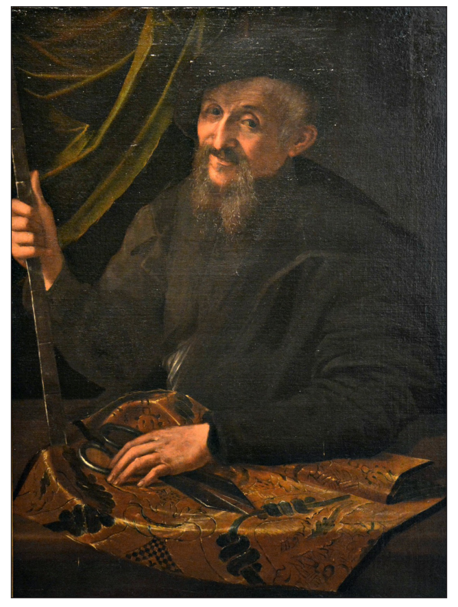
Fig. 3: Girolamo Mazzola Bedoli, Portrait of a Tailor, c. 1545, oil on canvas, 88 \times 71 cm, Museo di Capodimonte, Naples.

tailor really was an artisan, yet already in 1545 Pietro Aretino complained that portraiture was currently being degraded by depicting craftsmen like tailors, perhaps in allusion to Girolamo Mazzola Bedoli's painting of the very same year (Fig. 3).8 In comparison with Moroni's, Bedoli's tailor is old, clad in black, shown with the tools of his trade and a luxurious piece of fabric which achieve foreground status. Seated behind a table, with only the upper part of his body visible, the tailor's head and hands are lit, to emphasize the interplay between mental creativity and manual labour which characterizes the profession. By contrast, Moroni's tailor is young, erect, sexualized by the codpiece which emerges from his slashed breeches and by his confrontational gaze. Clad in the red and white often