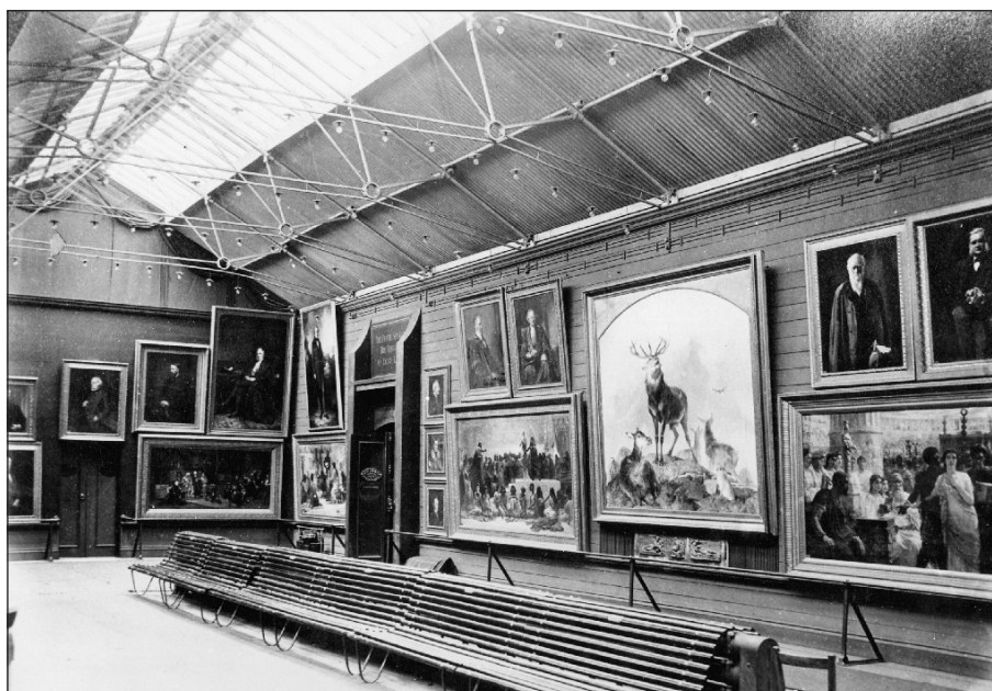
Fig. 2: Photograph of the Central Hall of the Fine Art Department, Manchester Jubilee Exhibition, 1887.

Manchester Jubilee Exhibition aimed to display and narrate the progress wrought in Victoria's reign. In this context, was Long's painting resituated to ask whether the choice — in an era of new biological knowledge — was between not Diana, but Darwin or Christ? I do not want to overemphasize the role played by Darwin's ideas in later nineteenth-century doubt; there were plenty of other challenges to faith, which were, for many people, part of belief (as explored above). But for those viewers who recognized Darwin and found his ideas difficult to reconcile with their faith, the juxtaposition of these two images dramatically transported the third-century Christian martyr's tribulations into a later nineteenth-century context. The contrast might also have served to reaffirm religious certainty or perhaps have been received with humour. The lack of comment on this juxtaposition is noteworthy. By the late 1880s were Darwin's ideas unremarkable, or too remarkable to have aroused comment? If nothing else, Fig. 2 demonstrates the perhaps surprising fact that Darwin was present in the world of late-Victorian martyr painting. A nineteenth-century audience would, of course, also have recognized other familiar figures and images alongside John Collier's portrait of Darwin ( Fig. 3 provides a key).