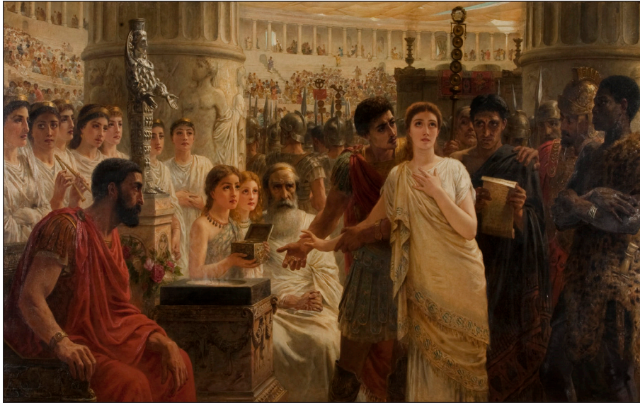
Fig. 1: Edwin Long, Diana or Christ? , 1881, oil on canvas, 121 × 211 cm. Long painted this second version of the painting in 1881. It is slightly smaller than the first version, and differs in two small details: the centurion does not have a plume on his helmet, and the standard has one less disc. The first version was exhibited at the RA (1881), and at the Manchester Jubilee Exhibition (1887). This version was shown at the Gallery of Sacred Art (1892), the Victorian Era Exhibitions, Earl's Court (1897), and since 1919 has been on display at Blackburn Art Gallery. For further details, see Mark Bills, Edwin Longsdon Long RA (London: Cygnus Arts, 1998), pp. 131–32.

Diana or Christ? to be the second-best painting of the Jubilee Exhibition. 17 In response to its popularity it was available for purchase as a print from 1889, allowing even wider dissemination. 18 It rapidly became the subject of sermons and was widely reviewed in Protestant publications like Sunday at Home , Girl's Own Paper (both published by the evangelical Religious Tract Society), Cassell's evangelical, temperance-supporting Quiver , and the Anglican Monthly Packet of Evening Readings for Younger Members of the English Church . One young woman's painting of her print of Diana or Christ? acted