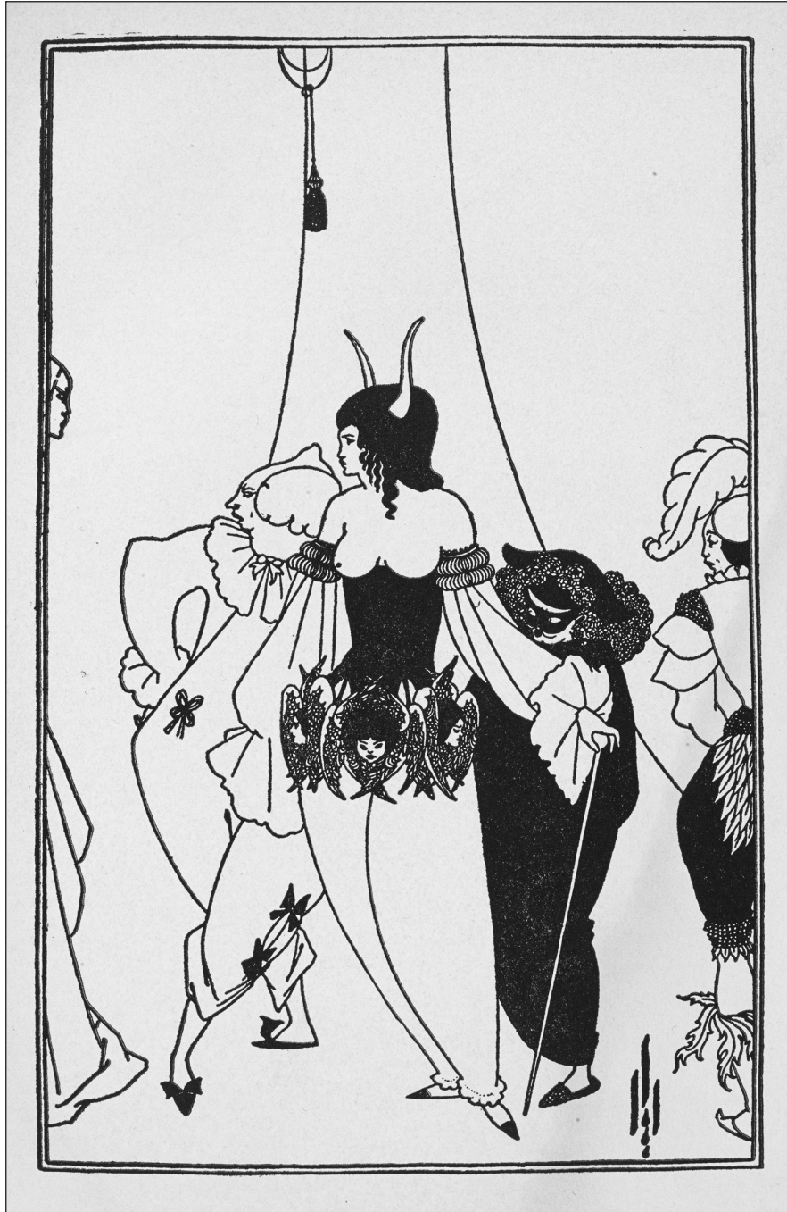
Fig. 3: Aubrey Beardsley, The Masque of the Red Death , 1894, Indian ink on white paper, repr. in Illustrations to Edgar Allen Poe (Indianapolis: Aubrey Beardsley Club, 1926).