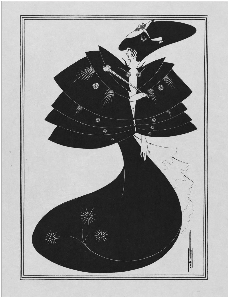
Fig. 2: Aubrey Beardsley, The Black Cape , 1893, Indian ink on white wove paper, Princeton University Library, Princeton, NJ, Aubrey Beardsley Collection (RS227).

Tate Britain fails to mediate the Beardsleyesque because it does not take ‘full advantage of [an exhibition’s] inherently spatial-temporal medium’ — the aspect which, as Madeleine Kennedy notes, defines ‘the most interesting and progressive exhibitions’. Unlike those shows which