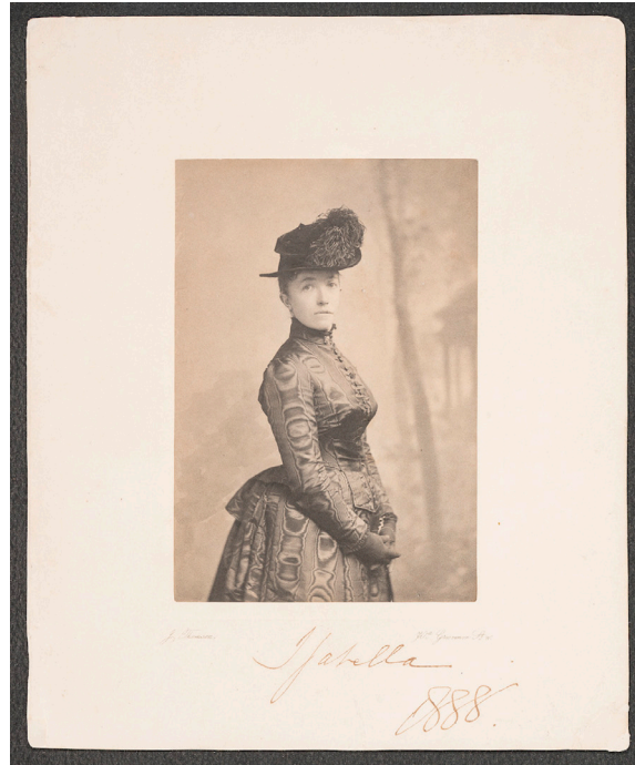
Fig. 8: Isabella Stewart Gardner, 1888.