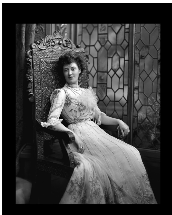
Fig. 6: Hon. Mrs Ronald Greville, later Dame Margaret (Helen Anderson) Greville, née McEwan, 1900.

A British society hostess of a similar time was Margaret Helen Greville (1863–1942), illegitimate daughter of Scottish brewing magnate William McEwan, with whom she visited the collection in July 1894. Despite her lack of pedigree, she married Ronald Greville, a Conservative politician and close friend of the Prince of Wales, later Edward VII ( Fig. 6 ). Margaret was a good friend of Mary of Teck, later Queen Consort of George V, and