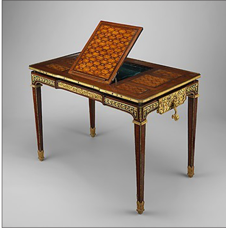
Fig. 4: Jean-Henri Riesener, Mechanical table, Paris, 1778, oak, veneered with marquetry, gilt bronze, Metropolitan Museum of Art, New York (inv. 33.12).

650,000 francs, perhaps due to its historical significance or its close association with Florence. 51 The importance of this small mechanical table is corroborated by the fact that it was ultimately acquired by the Metropolitan Museum of Art in New York, preceding the Blumenthal bequest that would come to the museum less than a decade later. 52