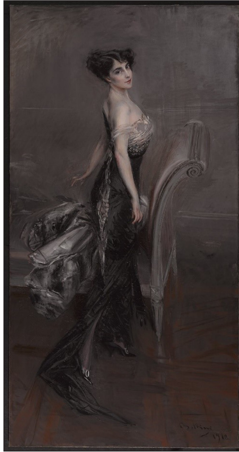
Fig. 7: Giovanni Boldini, Portrait of a Lady , Paris, 1912, oil on canvas, 231.1 × 121.3 cm, Brooklyn Museum (inv. 41.876).

arm, feet, and bottom of her gown, where the artist must have made compositional changes while the underlying layers of paint were still wet. The urgency to complete the portrait may have been due to the fact that it was exhibited at the Paris Salon of 1912. 68 The date of this portrait suggests that the Blumenthals were already immersed in sophisticated Parisian society before George's transfer to France by Lazard Frères in 1914 and prior to the purchase of their home on the boulevard de Montmorency. Although these are the only two known Boldini portraits of Florence, there has been reference to a small portrait of the couple's only child, George Blumenthal Jr, the whereabouts of which are unknown, as well as a surviving preparatory