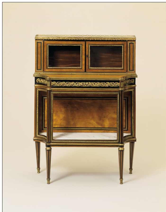
Fig. 5: Ladies' writing table ( Bonheur-du-Jour ), Paris, c. 1785, mahogany, teakwood, gilt bronze, marble, Hillwood Estate, Museum, and Gardens, Washington DC (inv. 31.3).

the Blumenthals, may have also regarded and employed this area of collecting as a means of assimilation and a display of appreciation for French culture. Another twentieth-century female collector who was passionate about French royal furniture, including Riesener's, was the heiress, collector, and philanthropist Marjorie Merriweather Post (1887–1973). Post acquired two pieces of eighteenth-century French furniture, including a small ladies' writing table, from the collection of George and Florence Blumenthal, conserved today at Hillwood Estate, Museum, and Gardens in Washington DC ( Fig. 5 ). 54