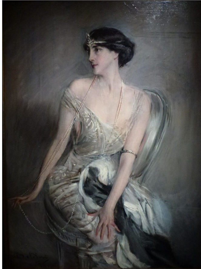
Fig. 6: Giovanni Boldini, Portrait of Madame G. Blumenthal , Paris, 1896, oil on canvas, 120 × 85 cm, Musée d'Orsay, Paris (inv. JdeP 816).

The second, full-size portrait of Florence by Boldini was completed in 1912 and portrays her as a fashionable woman dressed in a black-and-white satin gown, revealing her décolletage and shoulders, with bustling train and black jewel-buckled heels (Fig. 7). As a married woman who suffered the loss of a child four years earlier, the image conveyed in this portrait is one of optimism, energy, and strength. Florence is depicted standing with the half step of her right foot, as if in motion, perhaps just about to perch on the recumbent chaise longue beside her. Boldini's characteristic swirling brushwork, first employed around this time, rendered an abstract pattern of movement. 67 It has been noted that Boldini completed the portrait of Florence quickly due to the traction cracks around her hair, left