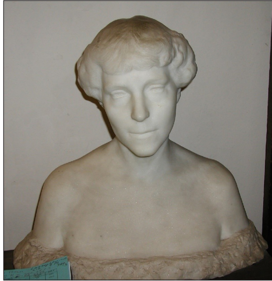
Fig. 10: Paul M. Landowski, Portrait Bust of Florence Blumenthal (1873–1930) , 1923, Carrara marble, 45.7 × 48.2 × 24.8 cm, Art Properties, Avery Architectural and Fine Arts Library, Columbia University (inv. 1968.10).

These five portraits of Florence Blumenthal convey her established social position, while maintaining her image as a fashionable and affluent trendsetter. Florence's societal evolution is especially evident in her reserved pose and expression in the two early Boldini portraits, as contrasted with the more assertive later depictions by Dunand and Landowski. The representations of Florence through a variety of media, including painting, photography, and sculpture, also underscore her passion and patronage for the arts.