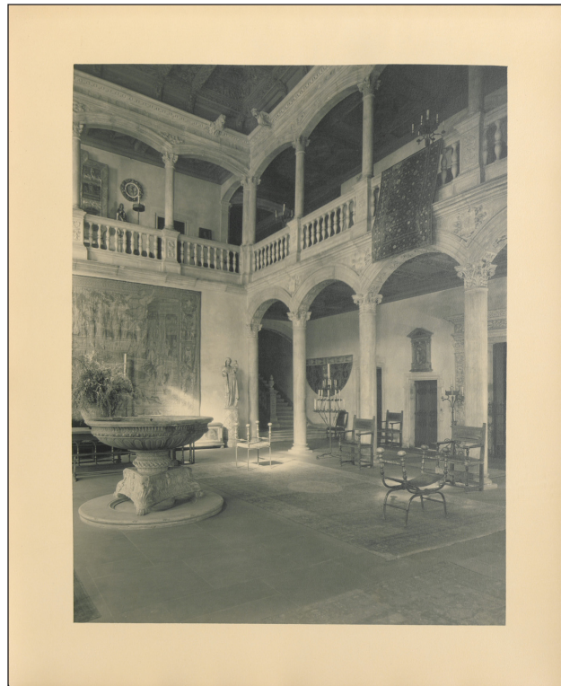
Fig. 1: The home of George and Florence Blumenthal, 50 East 70th Street, New York, 1920s, print, Metropolitan Museum of Art, New York (inv. 106.1 B622 Folio).

Although there is no concrete evidence that the Blumenthals ever visited Fenway Court, it is extremely likely that Gardner's house museum, with its central garden courtyard featuring a mix of Roman, medieval, and Renaissance sculpture and fountains bordered by surrounding galleries, served as a model for the Blumenthal New York home ( Fig. 1 ). 30 George and Florence Blumenthal also emulated Gardner's predilection for collecting