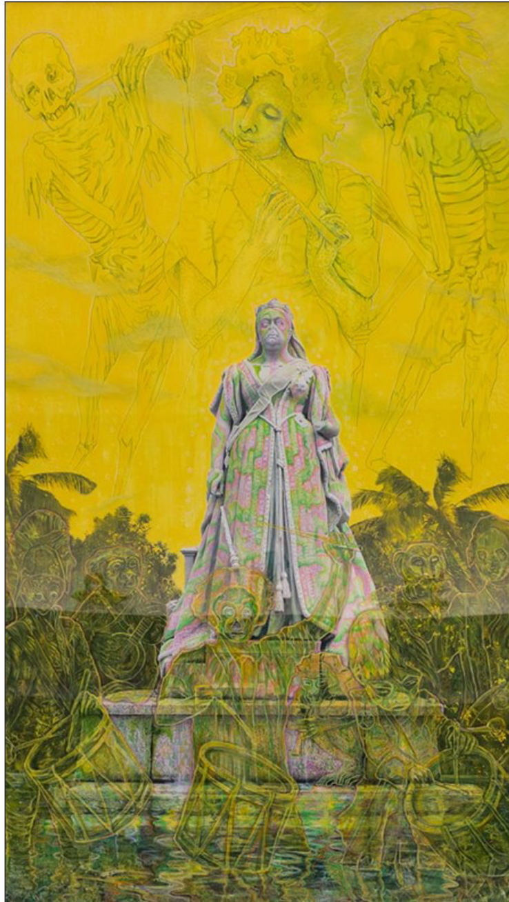
Fig. 3: Hew Locke, Hinterland (2013). Acrylic paint, ink, and pen on c-type photograph, 265 × 151.5 cm. © Hew Locke CC BY 4.0, DACS/Artimage 2021. Photo: Charles Littlewood.

The statue was unveiled in 1894 outside what was then the Victoria Law Courts. The subsequent history of the monument parallels that of Guyana's, as one might expect, given that history is one of struggle against colonialism, independence, and the realization of the nation. Thus, anti-colonial protestors dynamited the statue in