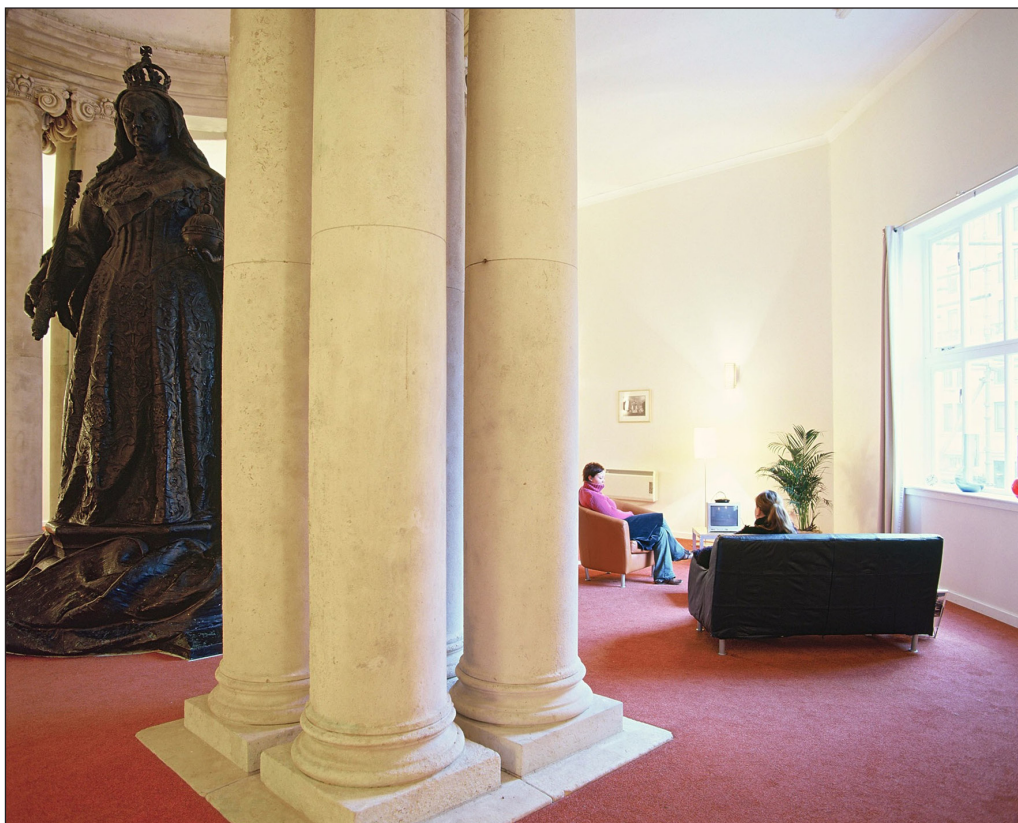
Fig. 1: Tatsurou Bashi, Villa Victoria (2002).

Villa Victoria was created for the Liverpool Biennial in 2002 and is one of a series of works by Tatsurou Bashi (a pseudonym of Tatzu Nishi) in which domestic or semi-domestic spaces are constructed around public monuments, thus recontextualizing them and, crucially, changing the relationship with the viewer ( Fig. 1 ). 23 In this instance the source material was the Victoria Monument in Liverpool, an elaborate piece of Edwardian baroque, created by C. J. Allen and unveiled in 1906. The statue of the Queen stands under a baldacchino , with allegorical groups around the dome and a statue of Fame atop it; a Fame that is also a Victory, the allegorical image of the Queen par excellence,