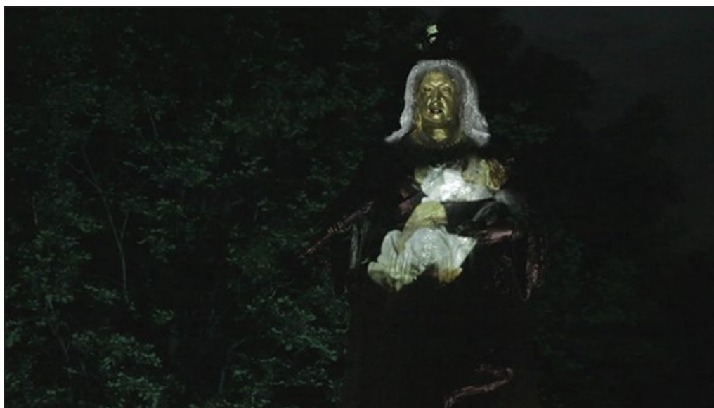
Fig. 4: Krzysztof Wodiczko and Gary Kirkham, Queen Victoria (2014).

On 12 and 13 June 2014, in Victoria Park, Kitchener, Ontario, Krzysztof Wodiczko projected the bodies of six people onto the statue of Queen Victoria that has pride of place in the park (Fig. 4). The projected participants, five refugees and one woman of