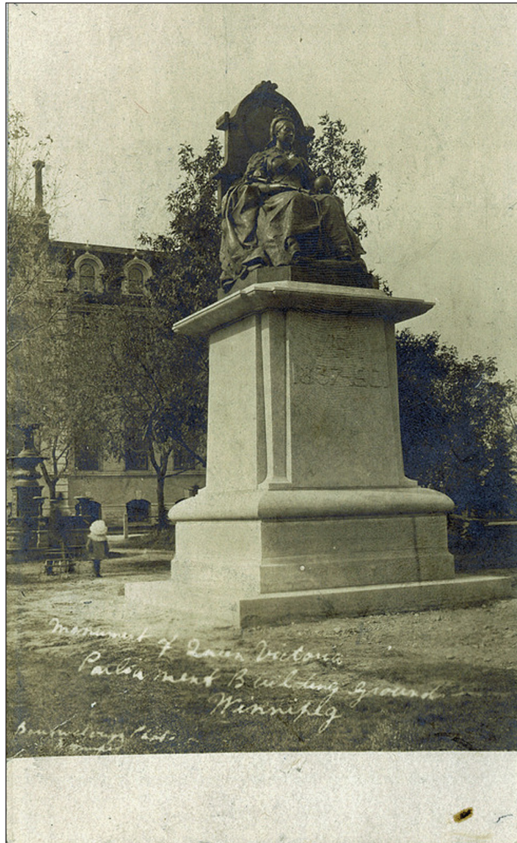
Fig. 5: View of statue of Queen Victoria on the front lawn of Manitoba Provincial Legislative Building in Winnipeg, Canada, early twentieth century, postcard. This statue by George Frampton, installed in 1904, was taken down and covered with paint by demonstrators in July 2021 as part of a protest over the deaths of Indigenous Canadian children at government-maintained residential schools during the twentieth century.

with Quebecois. In 1963 dynamite was used to topple Victoria's head from a Quebec City statue of the monarch. To the organizers of that decapitation, Victoria was seen as a symbol of English-Canadian domination over Quebec.