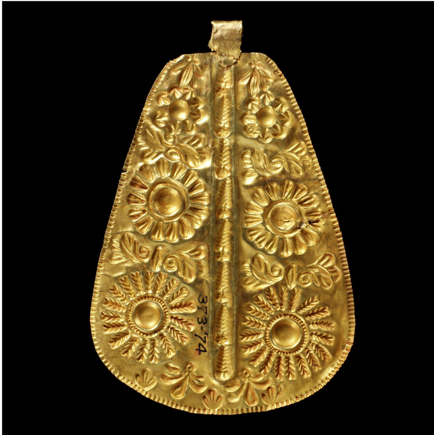
Fig. 1: Pendant, gold repoussé, Asante (Ashanti), 1850–74, Ghana, Museum no. 373–1874. This gold pendant from the Asante (Ashanti) Kingdom of Ghana is one of thirteen pieces of gold in the V&A collection that was taken by British troops when they raided the Asante capital, Kumasi, in 1874 in conflicts over gold-trading ports.

images of Africa, Asia, America, and Europe, so today we should curate Victoria at the heart of a global nexus of colonial exchange which is of profound importance to modern Britain.