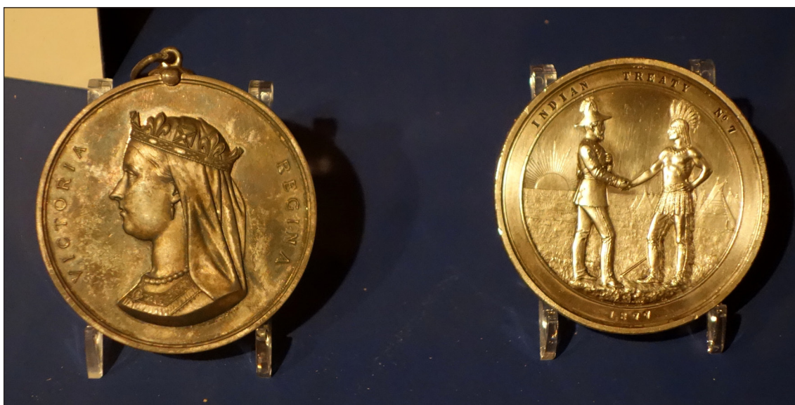
Fig. 3: Treaty medal, brass. The medal marks Treaty 7, 1877. Exhibited at Glenbow Museum, Calgary, Alberta, Canada, 2013.

It is not a quaint custom to write to the Queen. She is the constitutional head of the Canadian government with her representative — Governor General. The treaties